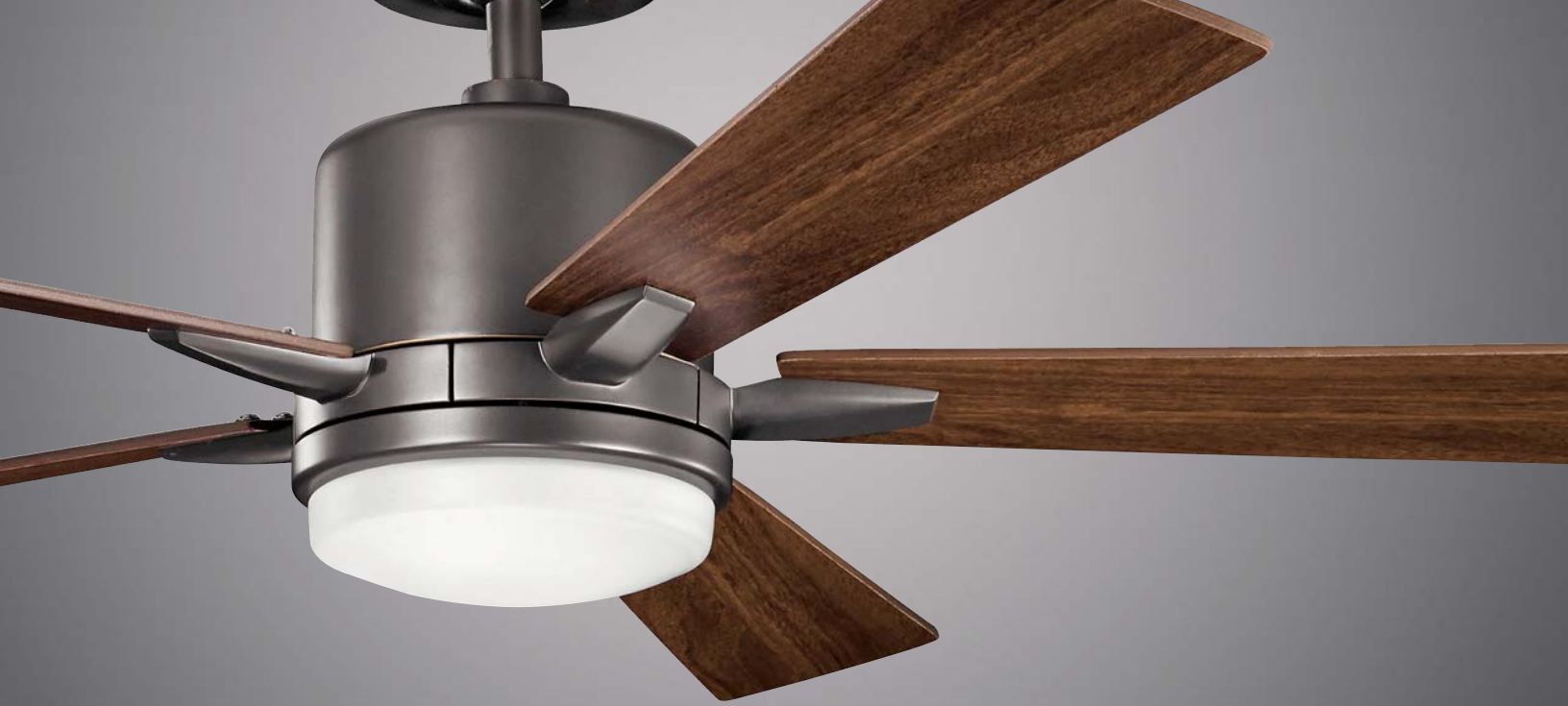
Shown: 330000Z Olde Bronze® Finish, Etched Cased Opal Glass, Walnut Blades