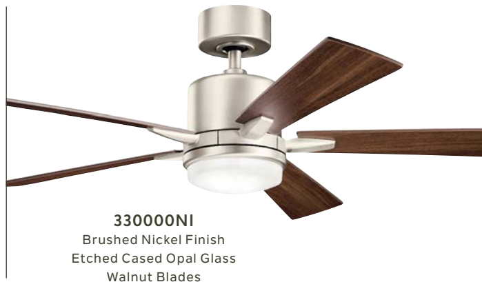
330000NI Brushed Nickel Finish Etched Cased Opal Glass Walnut Blades