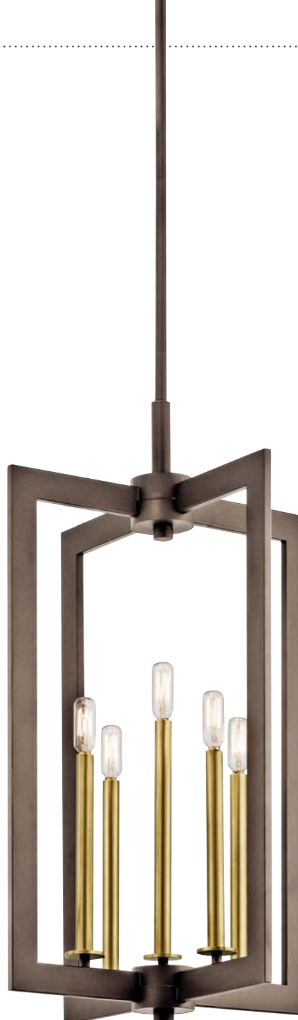
C | 43902 OZ Foyer Pendant