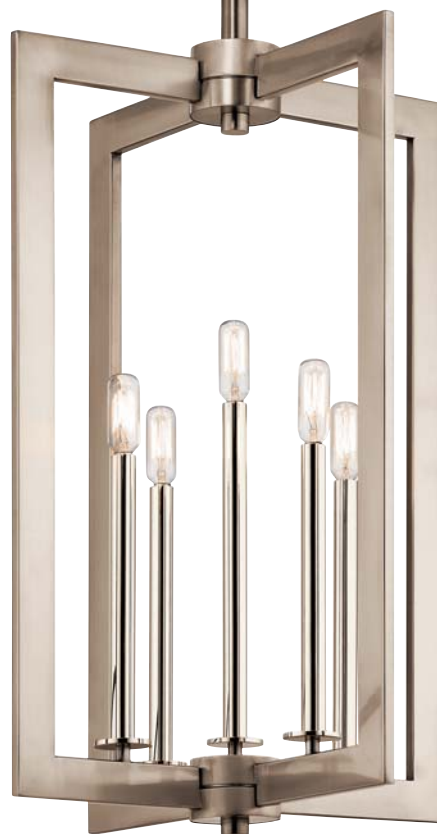
C | 43902 CLP Foyer Pendant