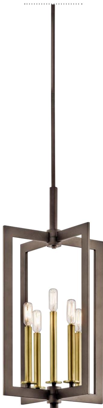
B | 43900 OZ Foyer Pendant