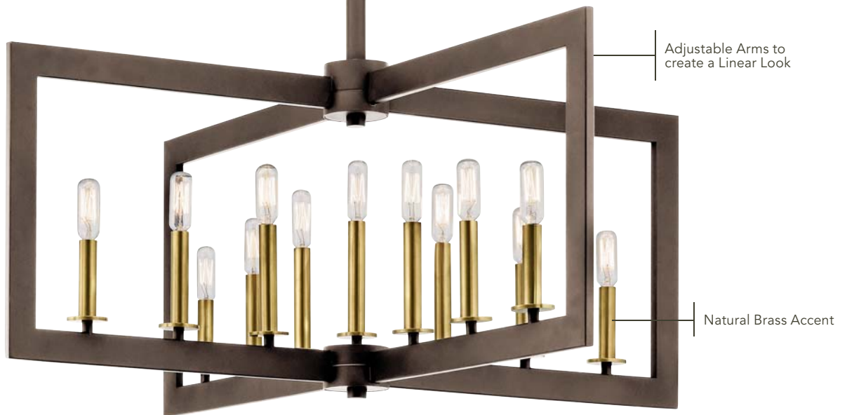
A | 43901 OZ Linear Chandelier

OLDE BRONZE® FINISH WITH NATURAL BRASS ACCENTS