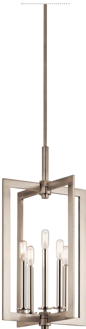
B | 43900 CLP Foyer Pendant