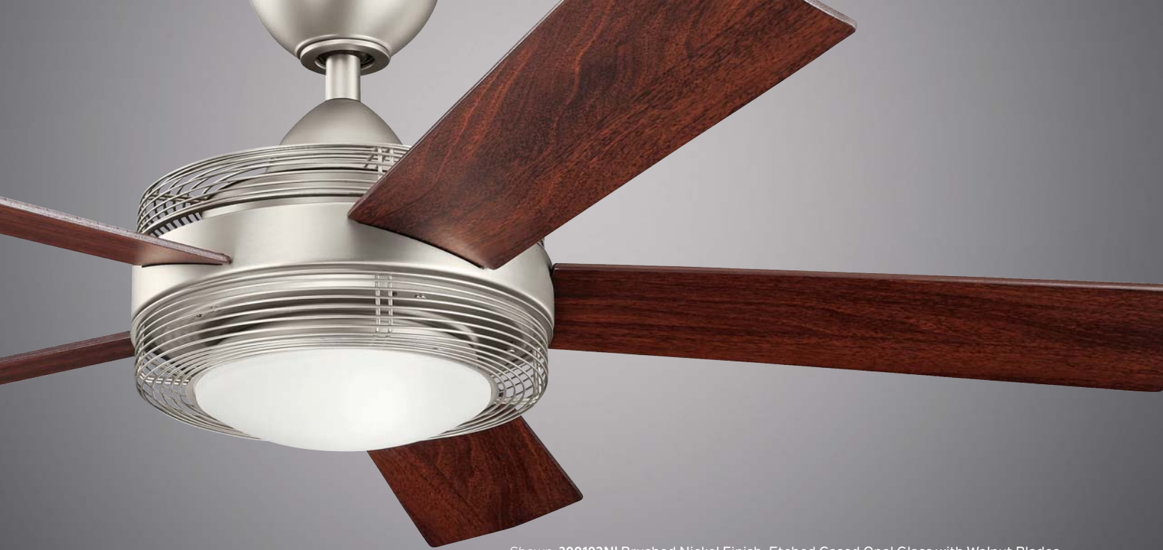
Shown: 300192NI Brushed Nickel Finish, Etched Cased Opal Glass with Walnut Blades