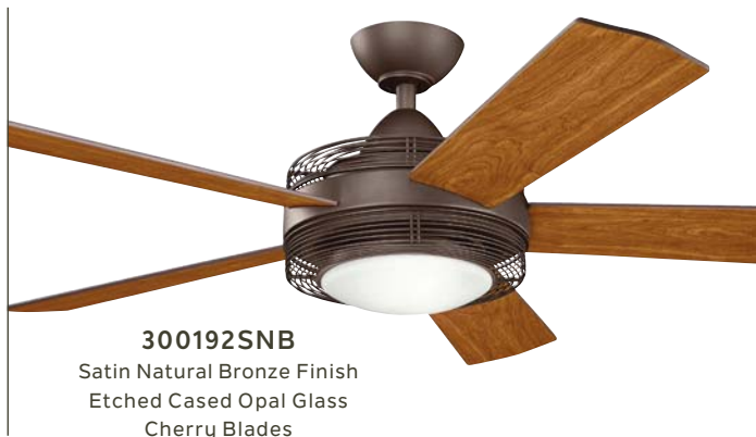
300192SNB Satin Natural Bronze Finish Etched Cased Opal Glass Cherry Blades