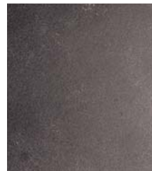
Weathered Zinc Finish detail