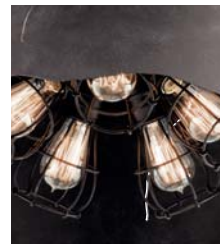
Caged bulb detail