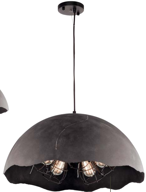
C | 43002 WZC Pendant

Shown with optional Vintage Filament Bulb 4071 CLR