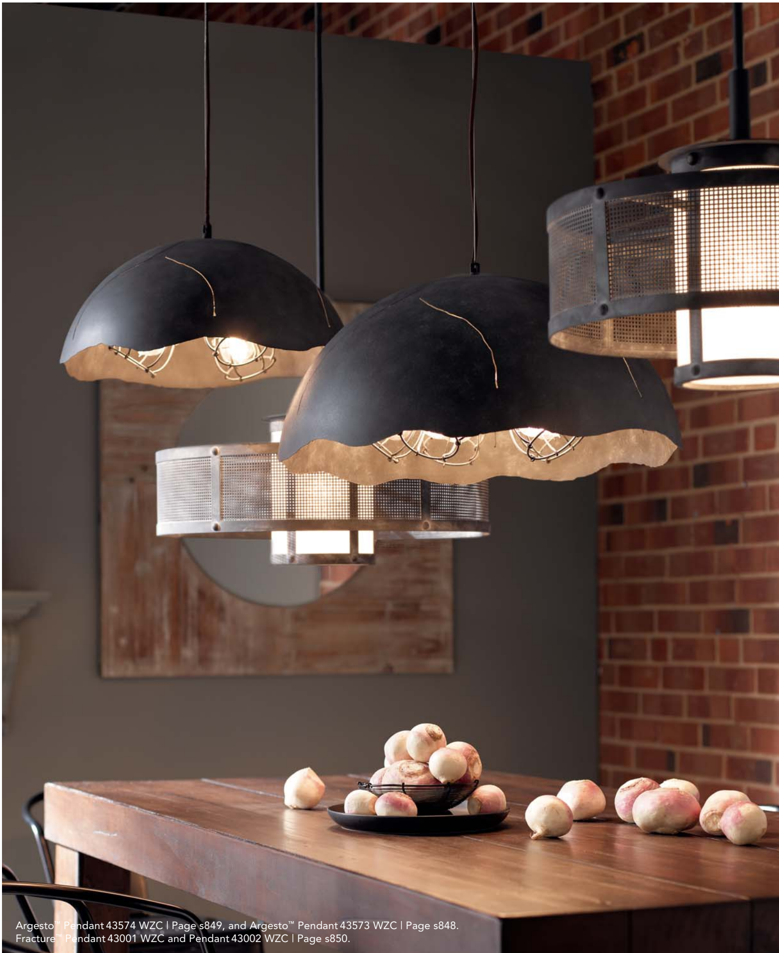
Argesto™ Pendant 43574 WZC | Page s849, and Argesto™ Pendant 43573 WZC | Page s848. Fracture™ Pendant 43001 WZC and Pendant 43002 WZC | Page s850.