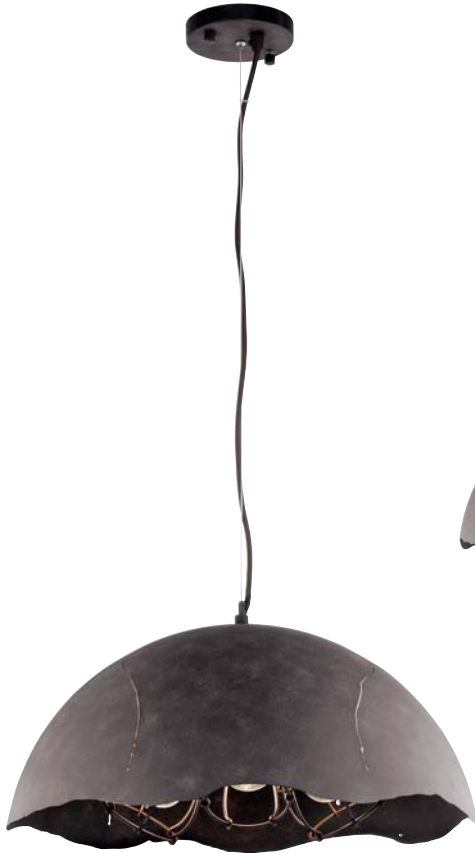
A | 43001 WZC Pendant