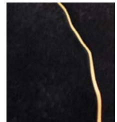
Fractured shade detail