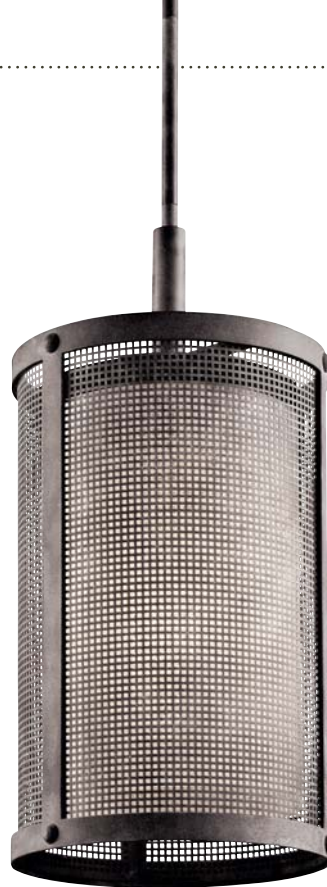
B | 43576 WZC Pendant