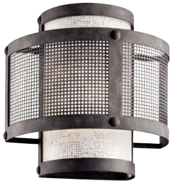
A | 43578 WZC Wall Sconce

WEATHERED ZINC™ FINISH WITH TEXTURED GLASS