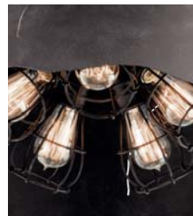
Caged bulb detail