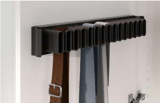
CONERO Belt- & Tie Pull-out with shim

KEY CW= Clear Cabinet Width | FW= Frame Width IW= Inner Width | BW= Bottom Width