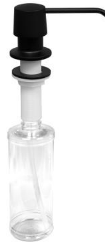
SD25MB Finish: Matte Black