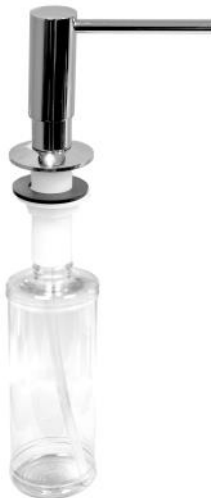
SD35C Finish: Chrome