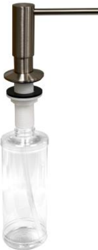
SD35SS Finish: Stainless Steel