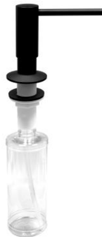
SD35MB Finish: Matte Black

We reserve the right to update product specifications without notice. Please visit karran.com for the most current specification sheets. All dimensions are accurate to 1/4". REV 05-2022