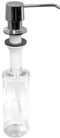
SD25C Finish: Chrome

Karran soap dispensers feature top quality brass construction and corrosion and rust resistant finishes. The smooth action pump is self-priming and the large capacity bottle holds 12oz of liquid soap or lotion. Refilling is easy from above the countertop. Threaded bottle attachment ensures a tight seal preventing spillage.