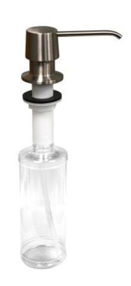
SD25SS Finish: Stainless Steel