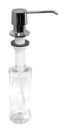
SD25C Finish: Chrome

Karran soap dispensers feature top quality brass construction and corrosion and rust resistant finishes. The smooth action pump is self-priming and the large capacity bottle holds 12oz of liquid soap or lotion. Refiling is easy from above the countertop. Threaded bottle attachment ensures a tight seal preventing spillage.