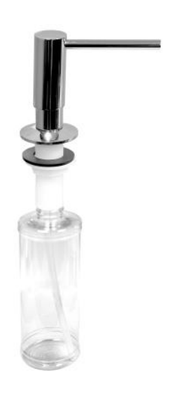
SD35C Finish: Chrome