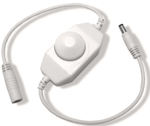
In-line Dimmer Switch