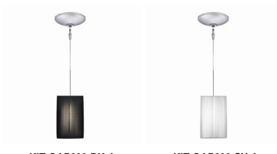
KIT-QAP230-BK-A Shade Finish: Black Canopy Finish: Satin Nickel

Each kit includes a Satin Nickel (A) or Chrome (B) Canopy with a Quick Adapt Jack, 8' cable, socket assembly, hang-straight tube and 12V lamp.