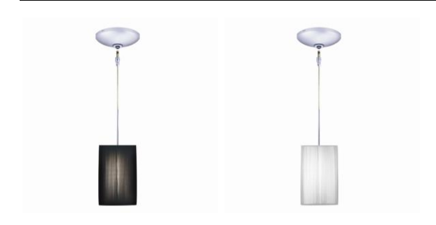
KIT-QAP230-BK/CH-B Shade Finish: Black Canopy Finish: Chrome