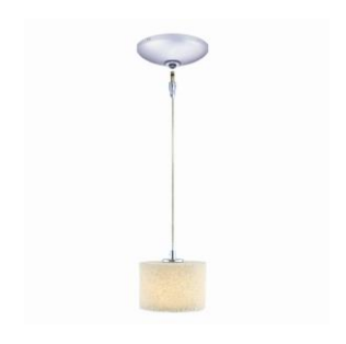
KIT-QAP222-CA/CH-B Shade Finish: Coral Canopy Finish: Chrome