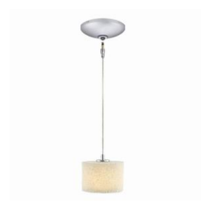
KIT-QAP222-CA-A Shade Finish: Coral Canopy Finish: Satin Nickel

Each kit includes a Satin Nickel (A) or Chrome (B) Canopy with a Quick Adapt Jack, 8' cable, socket assembly, hang-straight tube and 12V lamp.