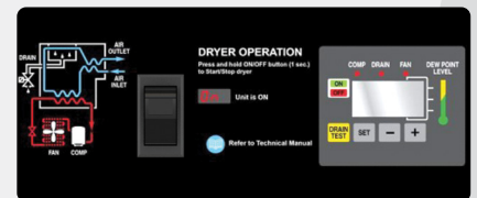
Intuitive Smart Controller