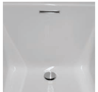
Linear Integral Waste and Overflow