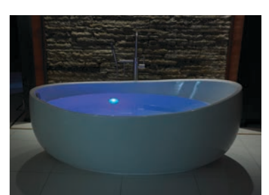
Chromatherapy-LED Lighting System