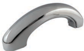
Standard Grab Bar