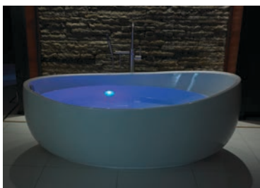
Chromatherapy-LED Lighting System