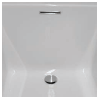
Linear Integral Waste and Overflow