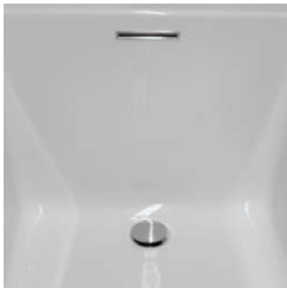
Linear Integral Waste and Overflow