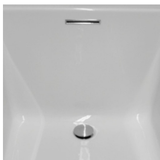
Linear Integral Waste and Overflow