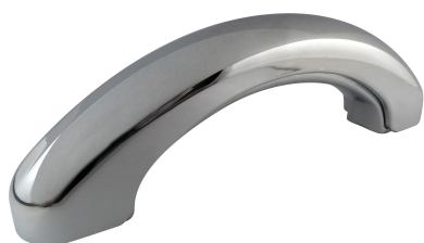
Standard Grab Bar