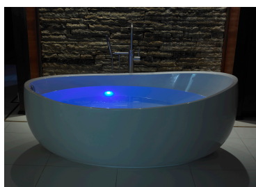
Chromatherapy-LED Lighting System