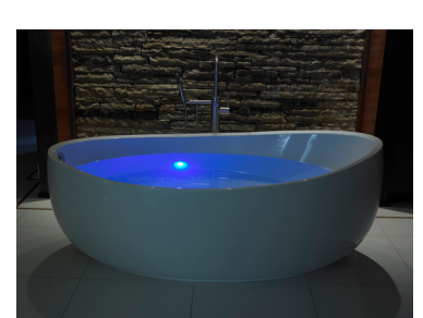
Chromatherapy-LED Lighting System