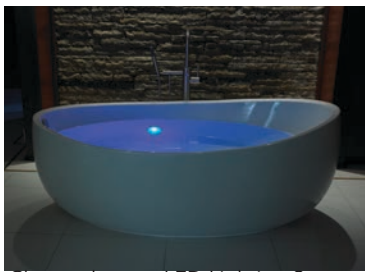
Chromatherapy-LED Lighting System