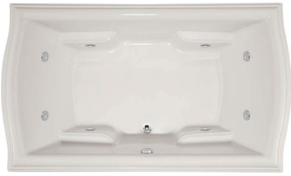
*Tub must be set in mortar base*