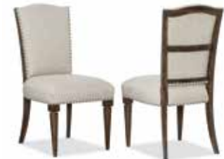
1618-75710-DKW Deconstructed Upholstered Side Chair Rubberwood and Hardwood Solids with Fabric: Abbey 20W x 26 1/2D x 41H (51 x 67 x 104 cm) shown on page 41