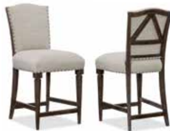
1618-25350-DKW Deconstructed Counter Stool Rubberwood and Hardwood Solids with Copper, Fabric: Abbey; Copper foot Rest 20 1/2W x 26D x 43 1/4H (52 x 66 x 110 cm) shown on page 44