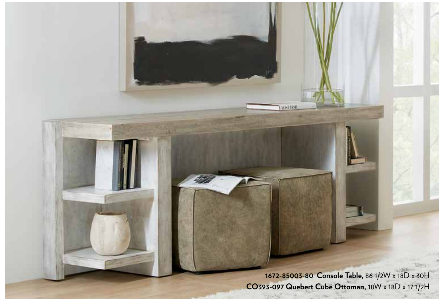
1672-85003-80 Console Table, 86 1/2W x 18D x 30H CO393-097 Quebert Cube Ottoman, 18W x 18D x 17 1/2H