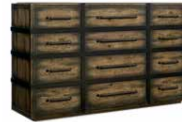
1654-90002-DKW1 Twelve-Drawer Dresser Poplar and Hardwood Solids with Oak Veneer, Aluminum Sheet and Cedar; Top left and right drawers have drop in felt liners, top center drawer has removable felt jewelry tray, three bottom drawer have cedar lined bottoms 68W x 19D x 41H (173 x 48 x 104 cm) shown on page 25, 26