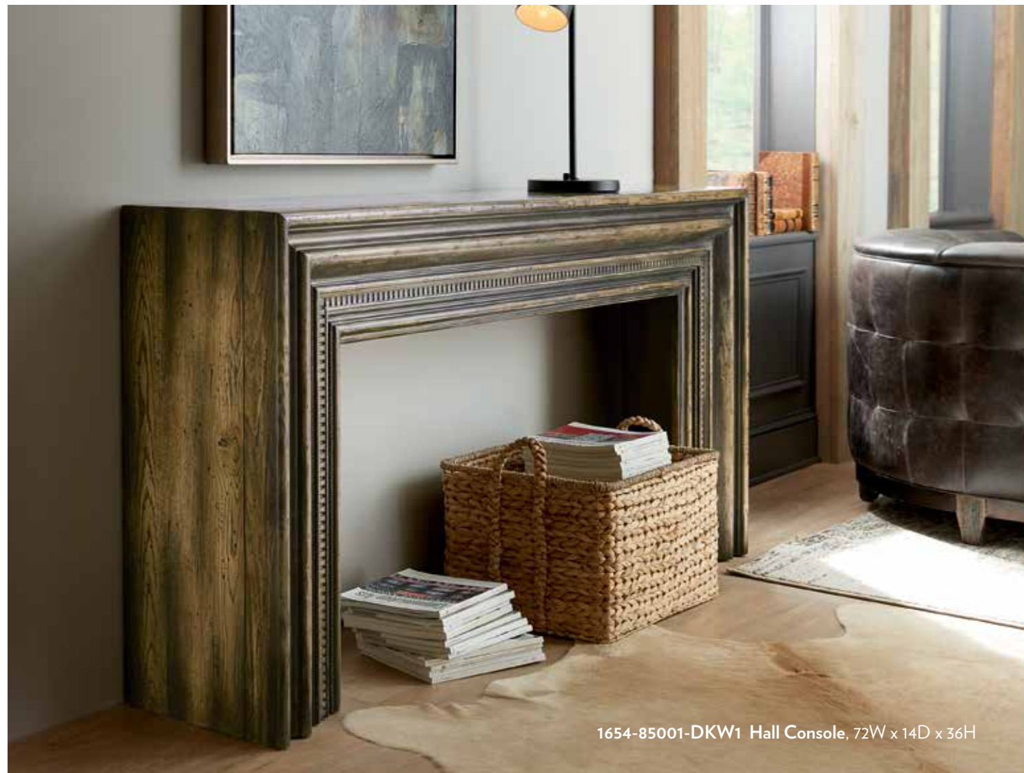
1654-85001-DKW1 Hall Console, 72W x 14D x 36H