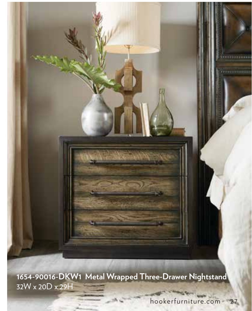
1654-90016-DKW1 Metal Wrapped Three-Drawer Nightstand 32W x 20D x 29H