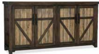
1618-75900-DKW Buffet Poplar and Hardwood Solids with Black Walnut, Maple, Pecan and White Oak Veneers and Four doors that are reversible with wood or burlap, two adjustable shelves behind each set of doors, one drawer behind each set of doors, LSF drawer has drop in felt silverware tray, RSF drawer has drop in felt liner, doors have soft close hinges 84W x 20 3/4D x 42 1/4H (213 x 53 x 107 cm) shown on page 44, 45