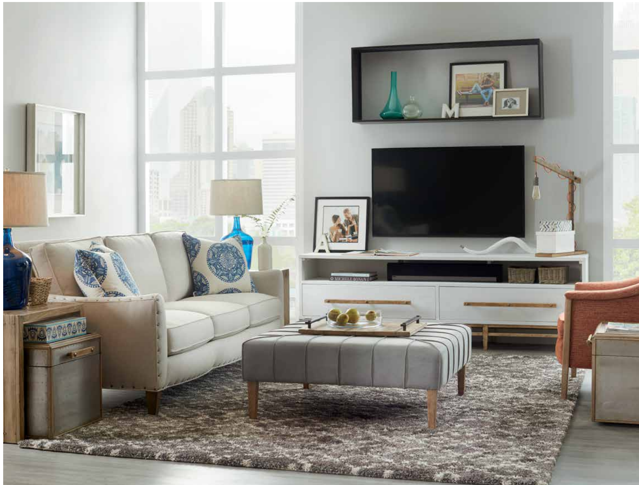
1620-55488-WH Low Entertainment Console, 88W x 19 3/4D x 28H 1620-50001-LTBR Nesting/Storage Table, Storage box: 20W x 18D x 18H / Table: 24W x 18D x 24 1/4H 1620-80110-LTBR Square Ottoman/Cocktail Table, 40 1/2W x 40 1/2D x 17H 7083-002 Langston 3 over 3 Sofa, 88W x 41D x 36 1/2H, See sammoore.com for more information. 4730 Easy Breezy Chair, See sammoore.com for more information. For more information on items please see our index on page 71.