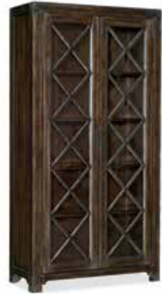
1618-75906A-DKW Bunching Display Cabinet Poplar and Hardwood Solids with Black Walnut Veneers and Seeded Glass Two wood framed doors with seeded glass and fretwork overlay, three adjustable wood framed glass shelves, one fixed wood framed glass shelf (3rd from top), one light controlled by three intensity touch switch 42W x 18D x 82H (107 x 46 x 208 cm) shown on page 42