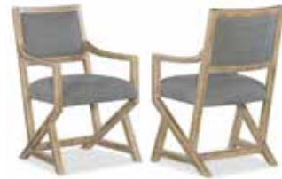
1620-75600-LTBR Upholstered Arm Chair Rubberwood and Hardwood Solids with Fabric: Castle 23W x 23 3/4D x 36 1/4H (58 x 60 x 92 cm) shown on page 65