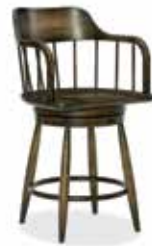
1654-25350-DKW1 Counter Stool Rubberwood and Beech Solids with Oak Veneer and Metal 22 1/2W x 23D x 40H (57 x 58 x 102 cm) shown on page 22