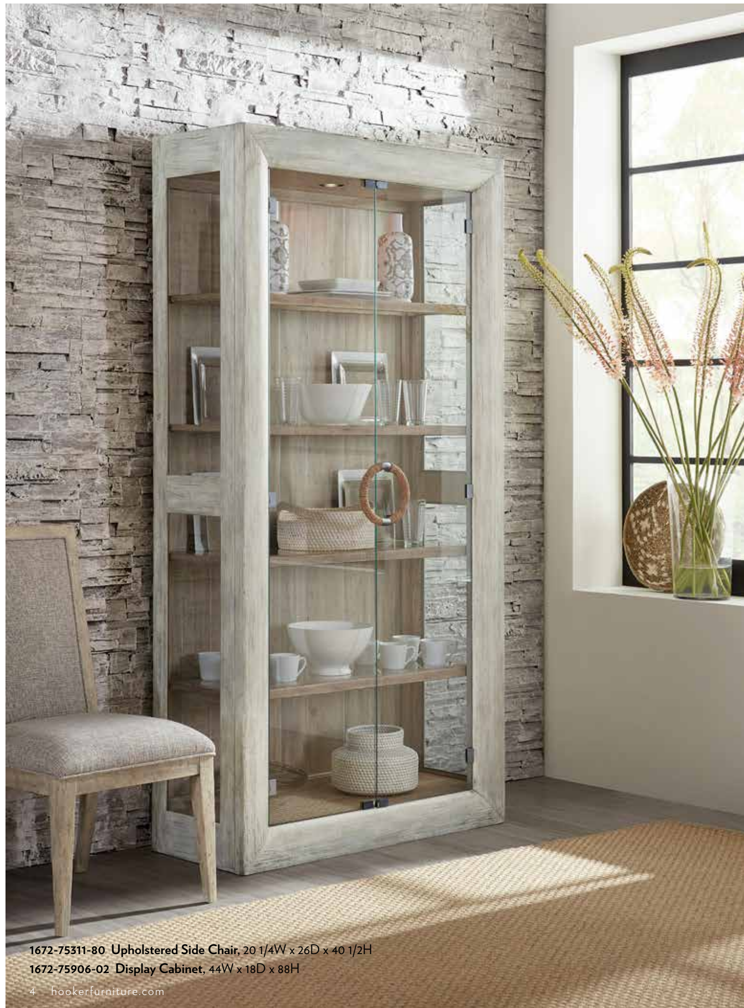
1672-75311-80 Upholstered Side Chair, 20 1/4W x 26D x 40 1/2H 1672-75906-02 Display Cabinet, 44W x 18D x 88H