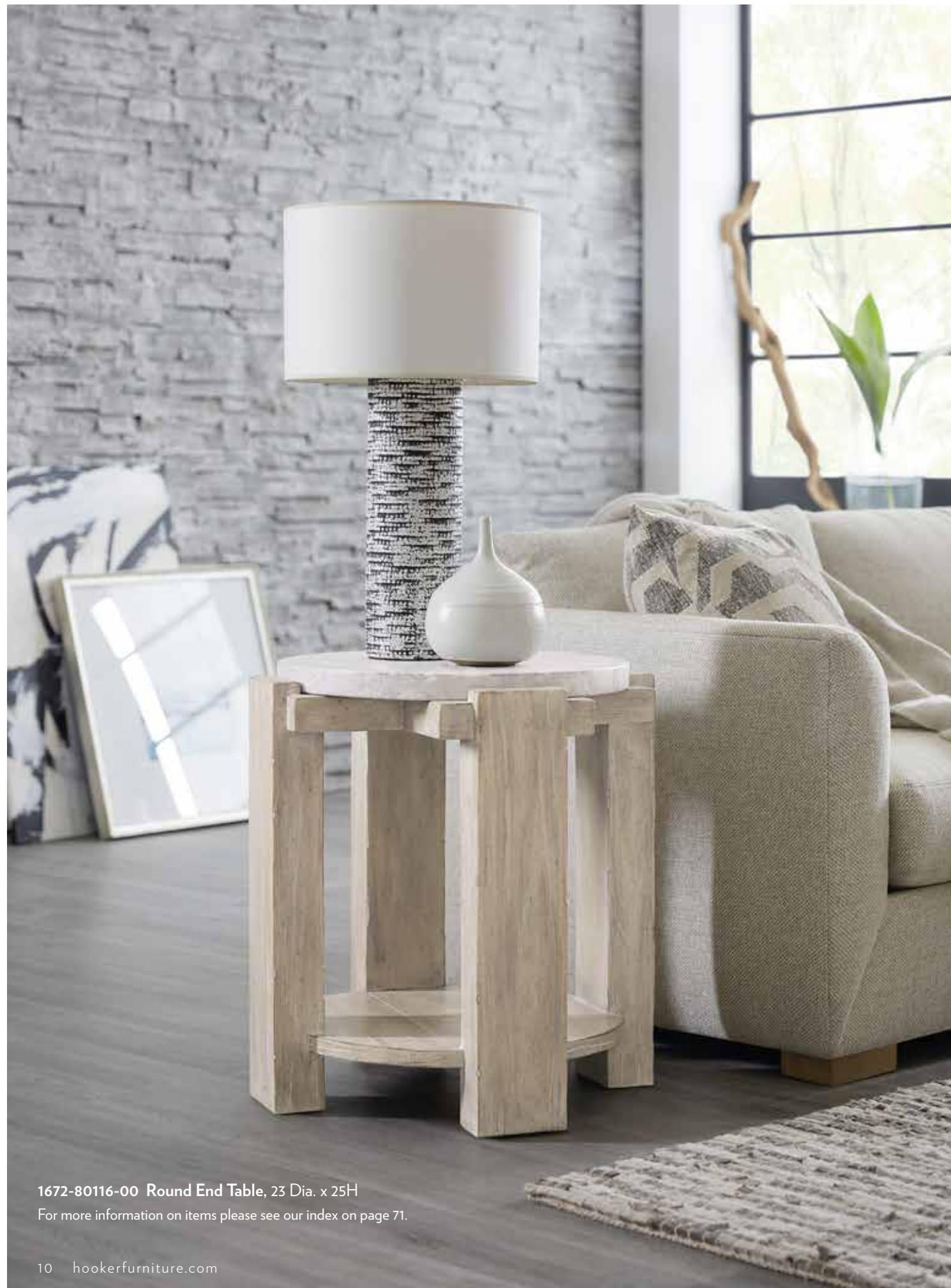
1672-80116-00 Round End Table, 23 Dia. x 25H For more information on items please see our index on page 71.