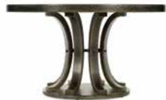
1654-75203-DKW1 54-inch Round Dining Table Poplar and Hardwood Solids with Oak Veneer and Metal; Will accommodate four chairs 54 Dia. x 30H (137 x 76 cm) shown on page 19, 20