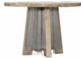
1620-75213A-LTBR 44-inch Metal Dining Table Poplar, Maple and Hardwood Solids with Aluminum Sheet; Will seat up to four chairs. 44 Dia. x 30H (112 x 76 cm) shown on page 66