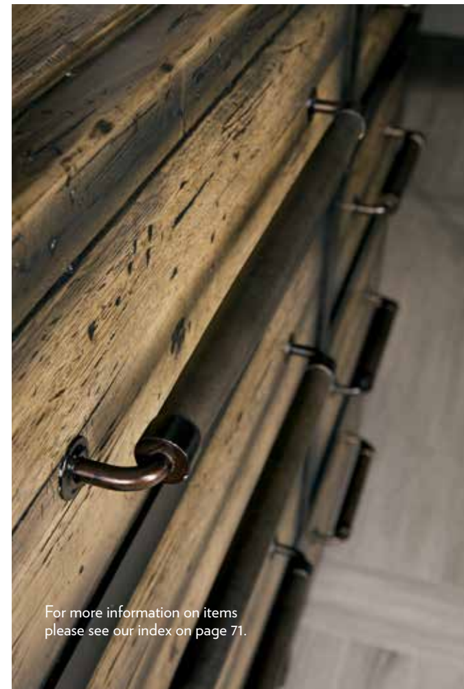
For more information on items please see our index on page 71.