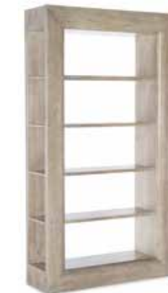
1672-10443-80 Etagere Poplar and Hardwood Solids with Pecan Veneer; Twelve adjustable shelves, four at front of case and four each on left and right end of case, finished on all sides 48W x 16D x 88H (122 x 41 x 224 cm) shown on page 7, 8, 14, 15