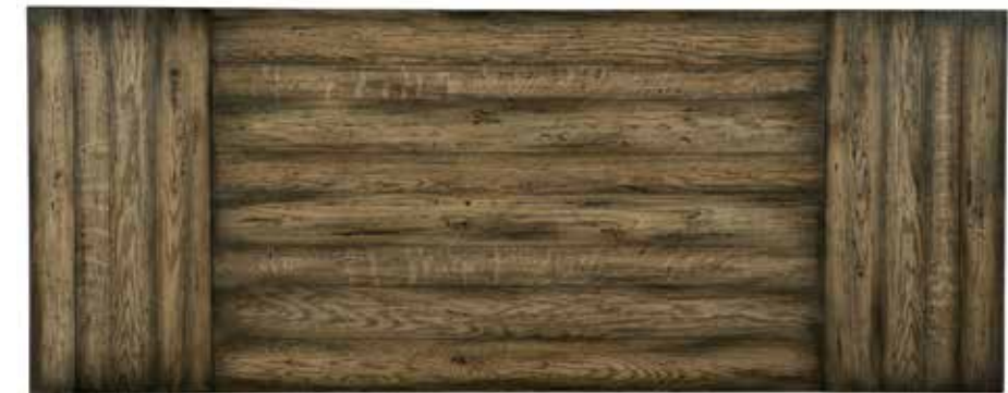
Top View of 1654-75206-DKW1 Friendship Table with Two 10-inch Leaves