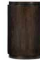
1654-50001-DKW2 Drum Table Rubberwood and Hardwood Solids with Oak and Elm Veneers and Gold Leaf 16W x 16D x 24H (41 x 41 x 61 cm) shown on page 38