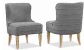
1620-35001-LTBR Upholstered Dining Chair Rubberwood and Hardwood Solids with Fabric: Castle 25W x 27D x 34 3/4H (64 x 69 x 88 cm) shown on page 67