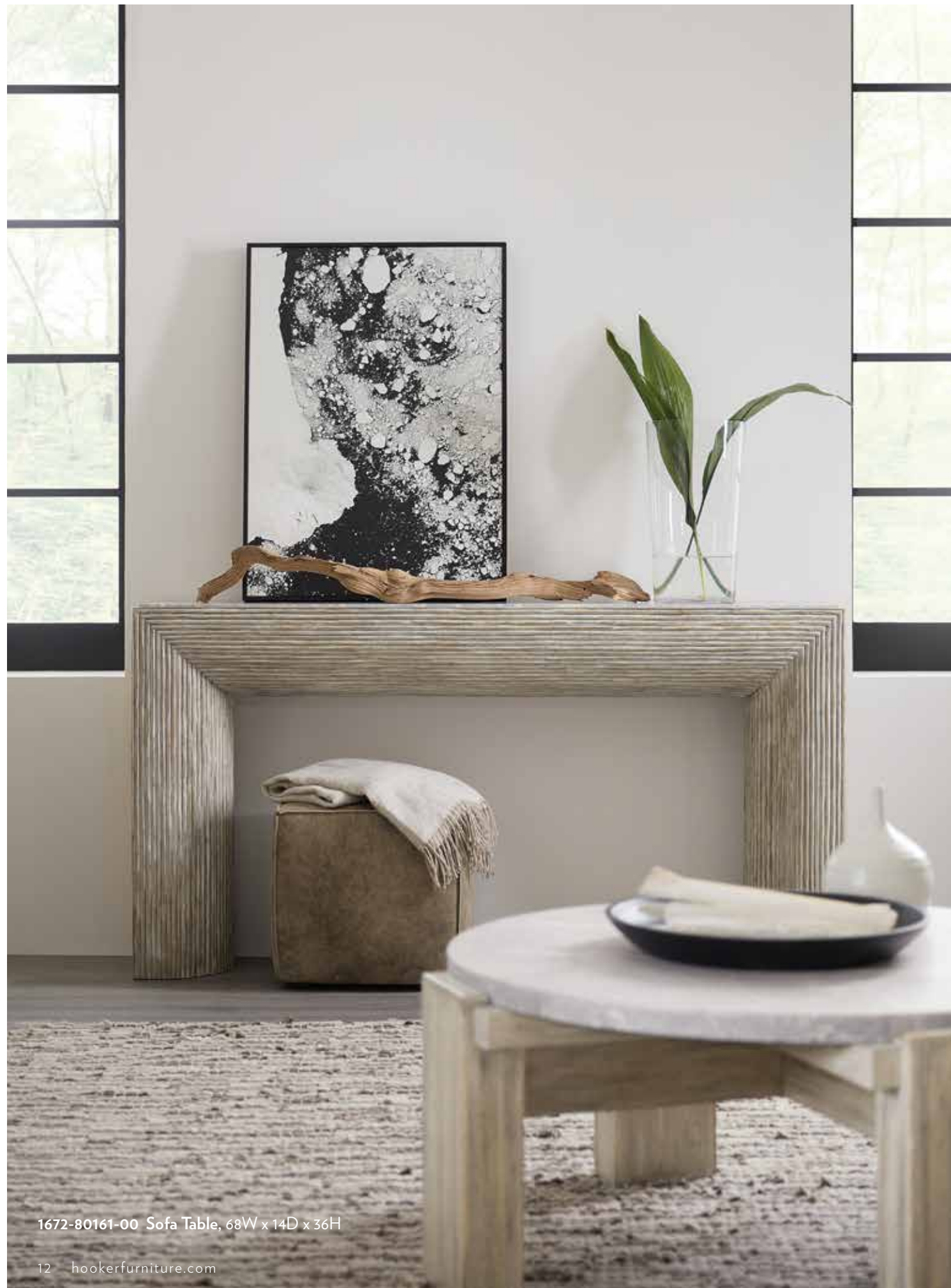
1672-80161-00 Sofa Table, 68W x 14D x 36H