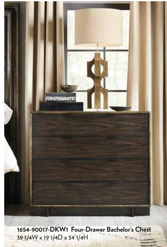
1654-90017-DKW1 Four-Drawer Bachelor's Chest 39 1/4W x 19 1/4D x 34 1/4H