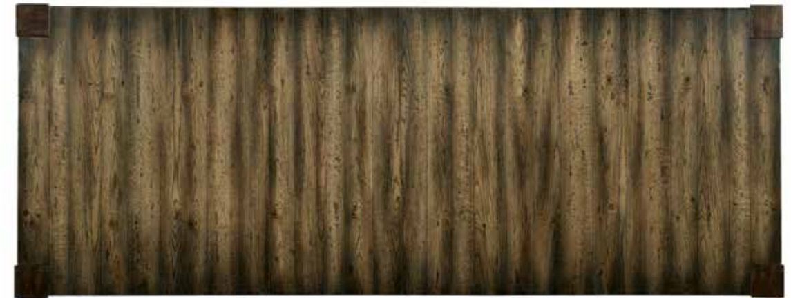
Top View of 1654-75200-DKW1 76-inch Rectangle Dining Table with Two 20-inch Leaves