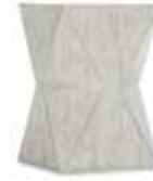
1672-50001-02 Spot Accent Table Poplar and Hardwood Solids with Pecan Veneer 16W x 16D x 24H (41 x 41 x 61 cm) shown on page 13, 14