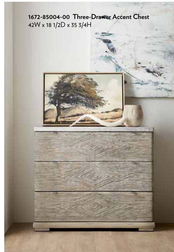
1672-85004-00 Three-Drawer Accent Chest 42W x 18 1/2D x 35 3/4H