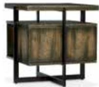
1654-80115-DKW1 Lamp Table Poplar Solids with Oak Veneer and Metal One open pass through storage area, two doors with touch latch, storage behind door 24W x 24D x 24H (61 x 61 x 61 cm) shown on page 28