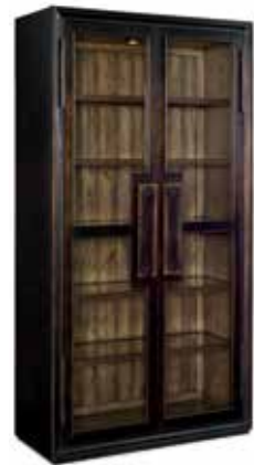
1654-75906-MTL Display Cabinet Poplar and Hardwood Solids with Oak Veneer, Aluminum Sheet and Seeded Glass; Two aluminum wrapped doors with seeded glass, four adjustable wood framed glass shelves, one fixed wood framed glass shelf located 3rd from the top, light with three intensity touch switch 42W x 18D x 82 1/4H (107 x 46 x 209 cm) shown on page 22, 23