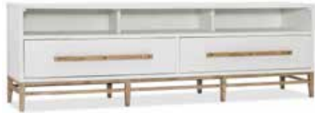
1620-55488-WH Low Entertainment Console Poplar, Beech and Hardwood Solids with Maple and White Oak Veneers and Aluminum Sheet; Two drawers, removable backpanel that has magnets to hold panel in place, three media openings Left/Right media openings: 27 7/8W x 17 5/8D x 7H (71 x 45 x 18 cm) Center media opening: 28W x 17 5/8D x 7H (71 x 45 x 18 cm) 88W x 19D x 28H (224 x 50 x 71 cm) shown on page 68, 69