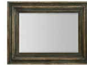
1654-90004-DKW1 Vertical Mirror Poplar Solids with Oak Veneer and Mirror; Beveled Mirror 38W x 2 1/2D x 50H (97 x 6 x 127 cm) shown on page 25, 26