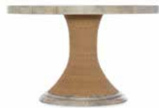
1672-75203-80 48-inch Round Pedestal Dining Table Poplar and Hardwood Solids with Pecan Veneer, Resin and Rope; Will accommodate up to five chairs from the Amani Collection 48 Dia. x 30H (122 x 122 x 76 cm) shown on page 6, 7