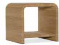
1672-80113-80 End Table Poplar and Hardwood Solids and Rope; One fixed shelf 26W x 24D x 24H (66 x 61 x 61 cm) shown on page 15