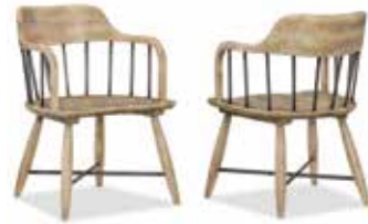
1620-75800-LTBR Low Windsor Arm Chair Rubberwood and Poplar Solids with Metal 22 3/4W x 24D x 32H (58 x 61 x 81 cm) shown on page 65