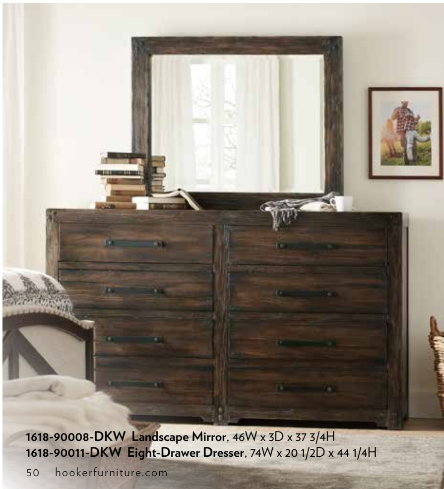
1618-90008-DKW Landscape Mirror, 46W x 3D x 37 3/4H 1618-90011-DKW Eight-Drawer Dresser, 74W x 20 1/2D x 44 1/4H