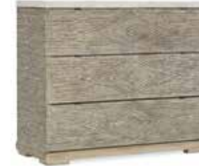
1672-85004-00 Three-Drawer Accent Chest Poplar and Hardwood Solids with Pecan, Maple and Oak Veneer and Cedar and Marble; Three drawers, top drawer has drop in felt liner, bottom drawer has cedar bottom, 42W x 18 1/2D x 36H (107 x 47 x 91 cm) shown on page 13