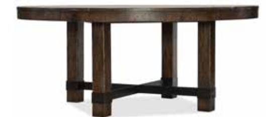
1618-75201-DKW 60-inch Round Dining Table Poplar and Hardwood Solids with Black Walnut Veneer and Metal Caps; Height is adjustable from 30" to 36"; Will seat up to six. 60 Dia. x 30-36H (152 x 76-91 cm) shown on page 43, 44