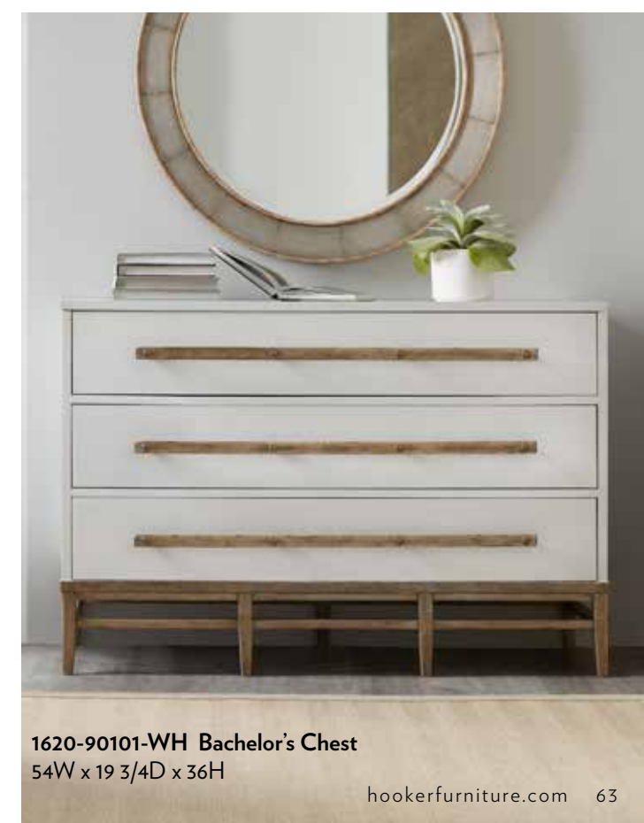
1620-90101-WH Bachelor's Chest 54W x 19 3/4D x 36H