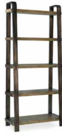
1654-10445-MTL Bookcase Poplar and Hardwood Solids with Oak Veneer and Aluminum Sheet; Five fixed shelves, posts are metal wrapped 40D x 18D x 88H (102 x 46 x 224 cm) shown on page 35, 36