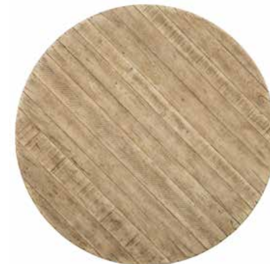
Top View of 1620-75213-LTBR 54-inch Metal Dining Table Also available: 1620-75213A-LTBR 44-inch Metal Dining Table