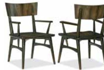
1654-75800-DKW1 Arm Chair Rubberwood and Hardwood Solids with Oak Veneer 25W x 22 1/2D x 36H (64 x 57 x 91 cm) shown on page 20