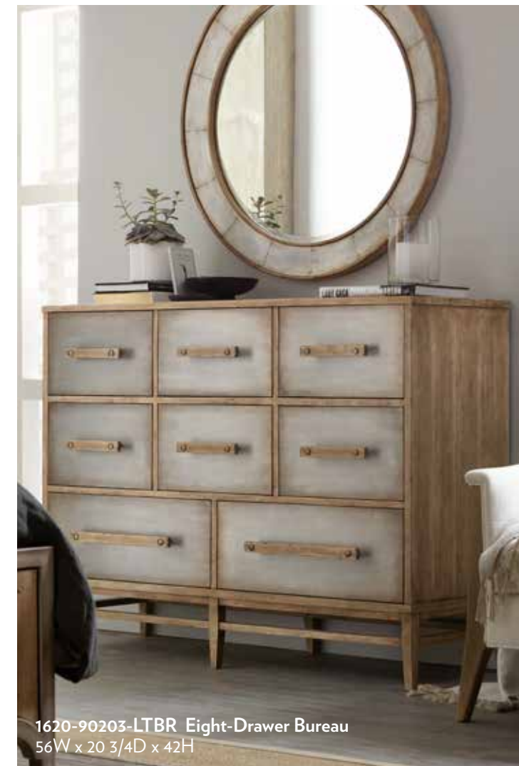
1620-90203-LTBR Eight-Drawer Bureau 56W x 20 3/4D x 42H