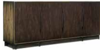
1654-55480-DKW2 Entertainment Console Poplar and Hardwood Solids with Oak and Elm Veneer and Gold Leaf; Four doors, left and right side facing doors have one adjustable wood shelf behind each door, center doors have one adjustable wood shelf behind the set of doors, all sections are ventilated, soft close hinges 79W x 18D x 32H (201 x 46 x 81 cm) shown on page 30