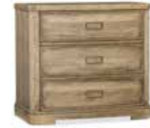
1620-90216-LTBR Three-Drawer Nightstand Poplar and Hardwood Solids with Maple, White Oak and Cedar Veneers Three drawers, top drawer has drop in felt liner, bottom drawer has cedar lined bottom, one live USB port and three electrical outlets, three stage touch dimmer switch on each side of case, one light underneath, cord clip 32W x 18 1/2D x 29 1/2H (81 x 47 x 75 cm) shown on page 62