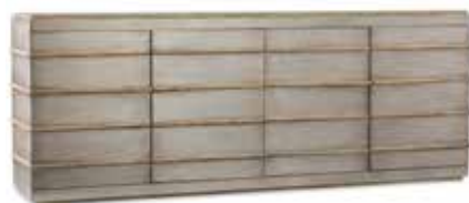
1620-55484-LTBR Metal Entertainment Credenza Poplar, Beech and Hardwood Solids with Maple and White Oak Veneers and Aluminum Sheet Four doors with one adjustable shelf behind each set, ventilated backpanel, soft close hinges 84 3/4W x 19D x 32 1/2H (215 x 48 x 83 cm) shown on page 64