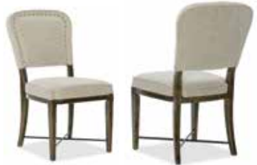
1654-75410-DKW1 Upholstered Side Chair Rubberwood and Hardwood Solids with and Nailheads Fabric: Merit Dove Performance Fabric 20 1/2W x 22 1/2D x 38H (52 x 57 x 97 cm) shown on page 16, 17, 23