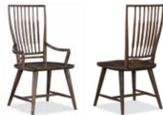
1618-75300-DKW Spindle Back Arm Chair Poplar, Rubberwood and Beech Solids 22 1/4W x 23 1/2D x 41H (57 x 60 x 104 cm) shown on page 42