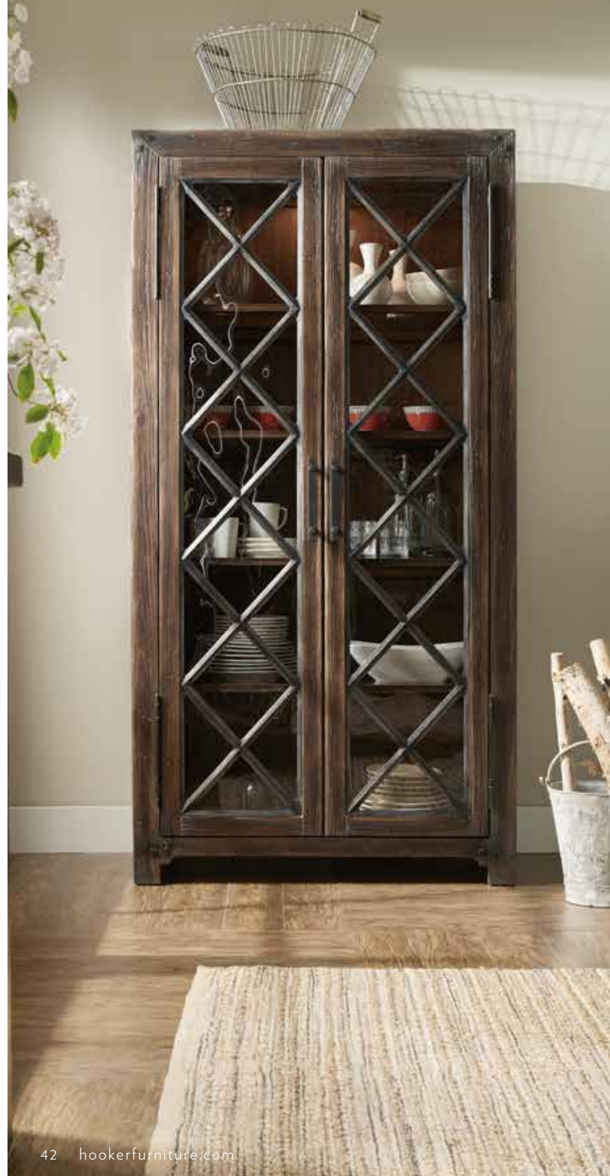
1618-75906A-DKW Bunching Display Cabinet, 42W x 18D x 82H For more information on items please see our index on page 71.