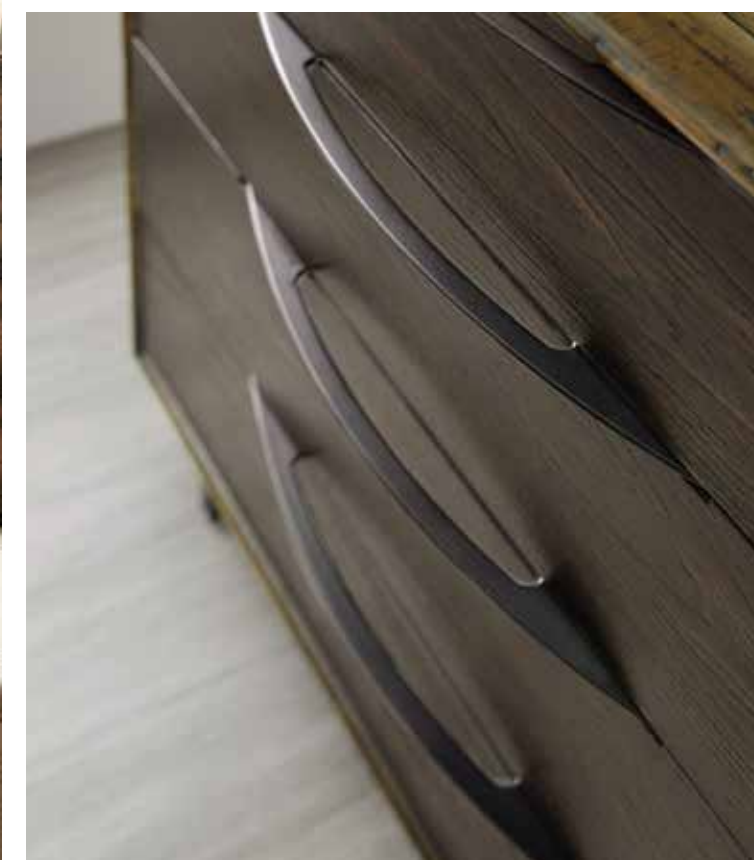
1654-90266-DKW1 King Panel Bed 87 1/4W x 88D x 73 1/4H