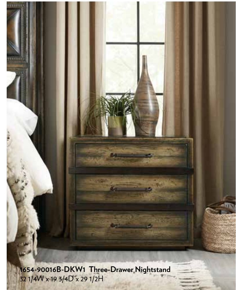
1654-90016B-DKW1 Three-Drawer Nightstand 32 1/4W x 19 3/4D x 29 1/2H