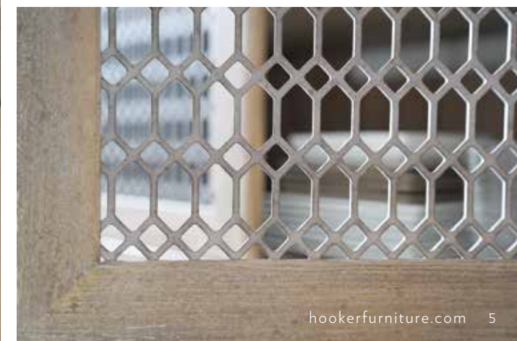
1672-75900-80 Four-Door Buffet, 85W x 20D x 40H For more information on items please see our index on page 71.

The Four-Door Buffet features four wood framed doors with decorative metal insets, one fixed shelf behind each set of doors, one drawer behind each set of doors with one drop in felt liner and one drop in silver tray.