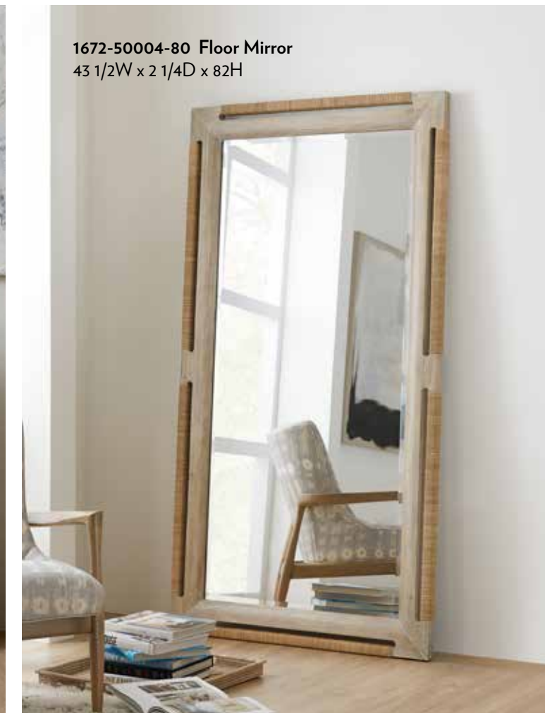
1672-50004-80 Floor Mirror 43 1/2W x 2 1/4D x 82H