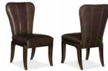
1654-75610-DKW1 Leather Side Chair Rubberwood and Hardwood Solids with Leather: Bronx Fudge 21 3/4W x 27D x 40H (55 x 69 x 102 cm) shown on page 19