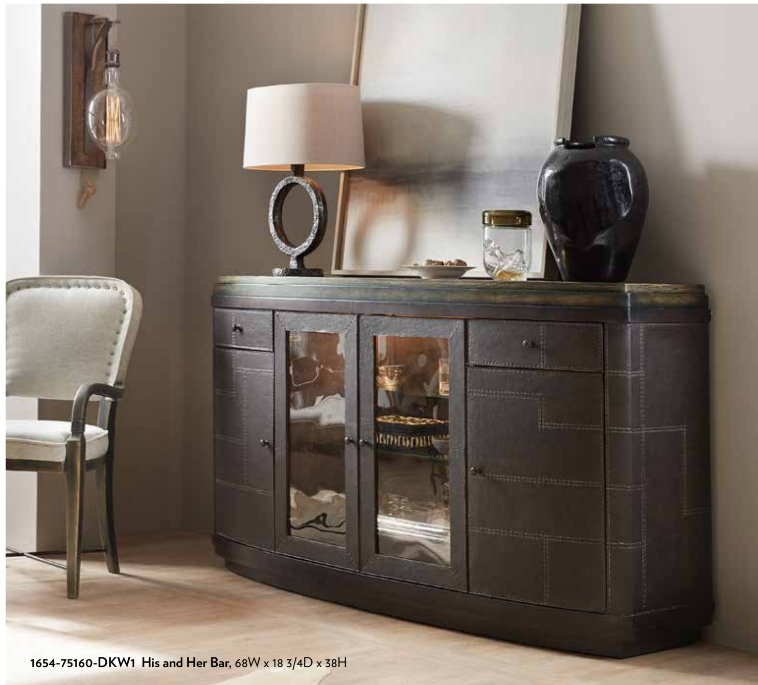
1654-75160-DKW1 His and Her Bar, 68W x 18 3/4D x 38H