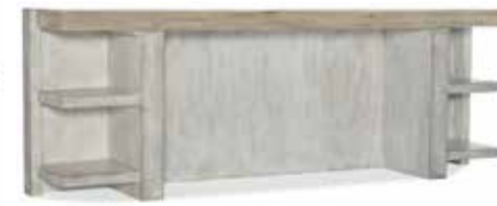
1672-85003-80 Console Table Poplar and Hardwood Solids with Pecan Veneer Four fixed shelves 86 3/4W x 18D x 30H (220 x 46 x 76 cm) shown on page 11