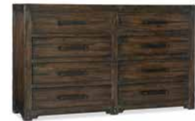
1618-90011-DKW Eight-Drawer Dresser Poplar and Hardwood Solids with Black Walnut, Cedar, Maple and White Oak Veneers; Eight drawers, top LSF has drop front and drop in felt liner, top RSF has removable felt jewelry tray, both bottom drawers have cedar lined bottom 74W x 20 1/2D x 44 1/4H (188 x 52 x 112 cm) shown on page 50