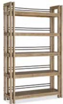
1620-10443-LTBR Etagere Poplar and Hardwood Solids with Maple Veneer and Metal; Five fixed shelves 52 1/2W x 16D x 86H (133 x 41 x 218 cm) shown on page 70