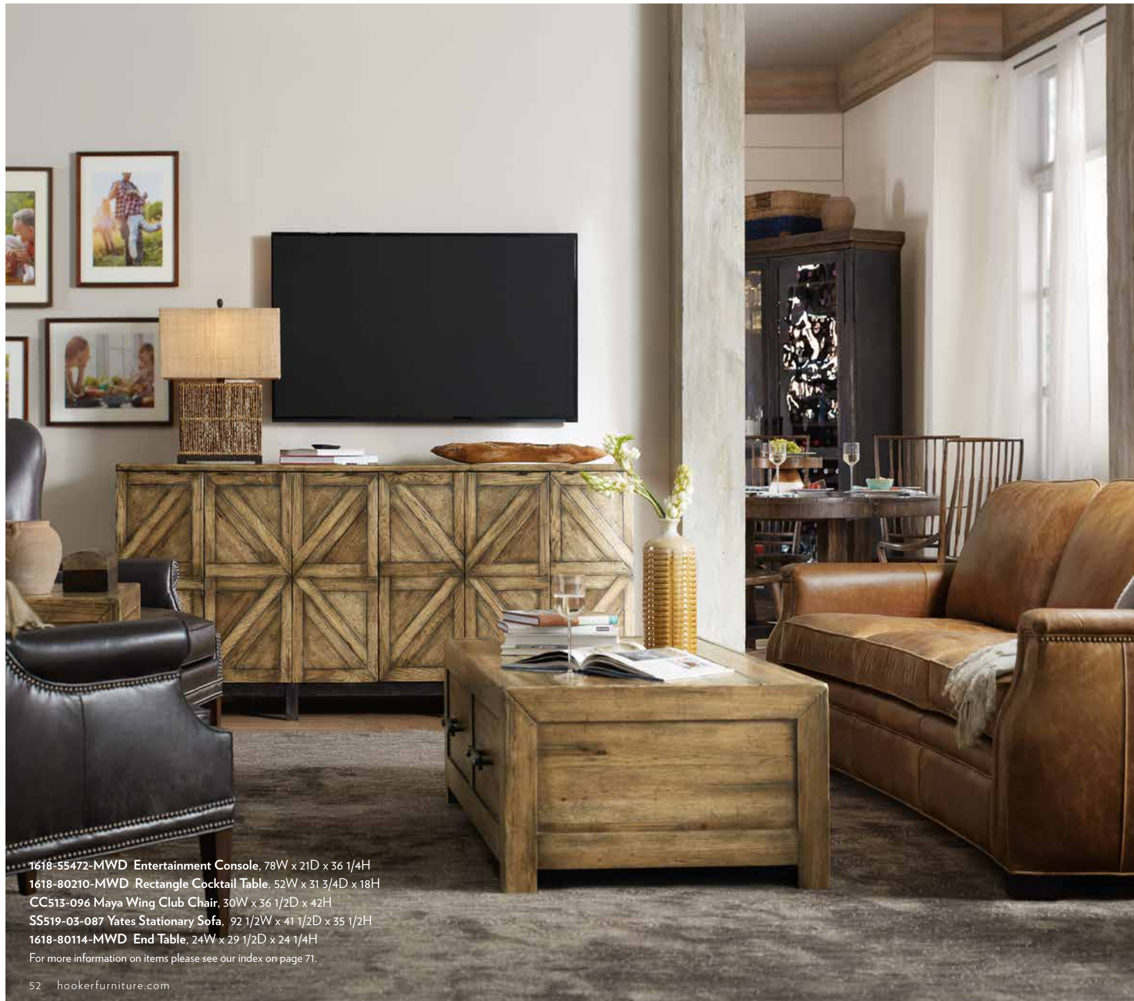
1618-55472-MWD Entertainment Console, 78W x 21D x 36 1/4H 1618-80210-MWD Rectangle Cocktail Table, 52W x 31 3/4D x 18H CC513-096 Maya Wing Club Chair, 30W x 36 1/2D x 42H SS519-03-087 Yates Stationary Sofa, 92 1/2W x 41 1/2D x 35 1/2H 1618-80114-MWD End Table, 24W x 29 1/2D x 24 1/4H For more information on items please see our index on page 71.