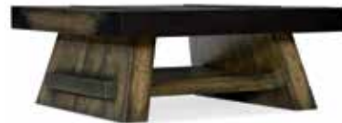
1654-80111-DKW1 Cocktail Table Poplar and Hardwood Solids with Oak Veneer and Aluminum Sheet; One shelf, two end caps are aluminum wrapped 44W x 44D x 18 1/2H (112 x 112 x 47 cm) shown on page 28