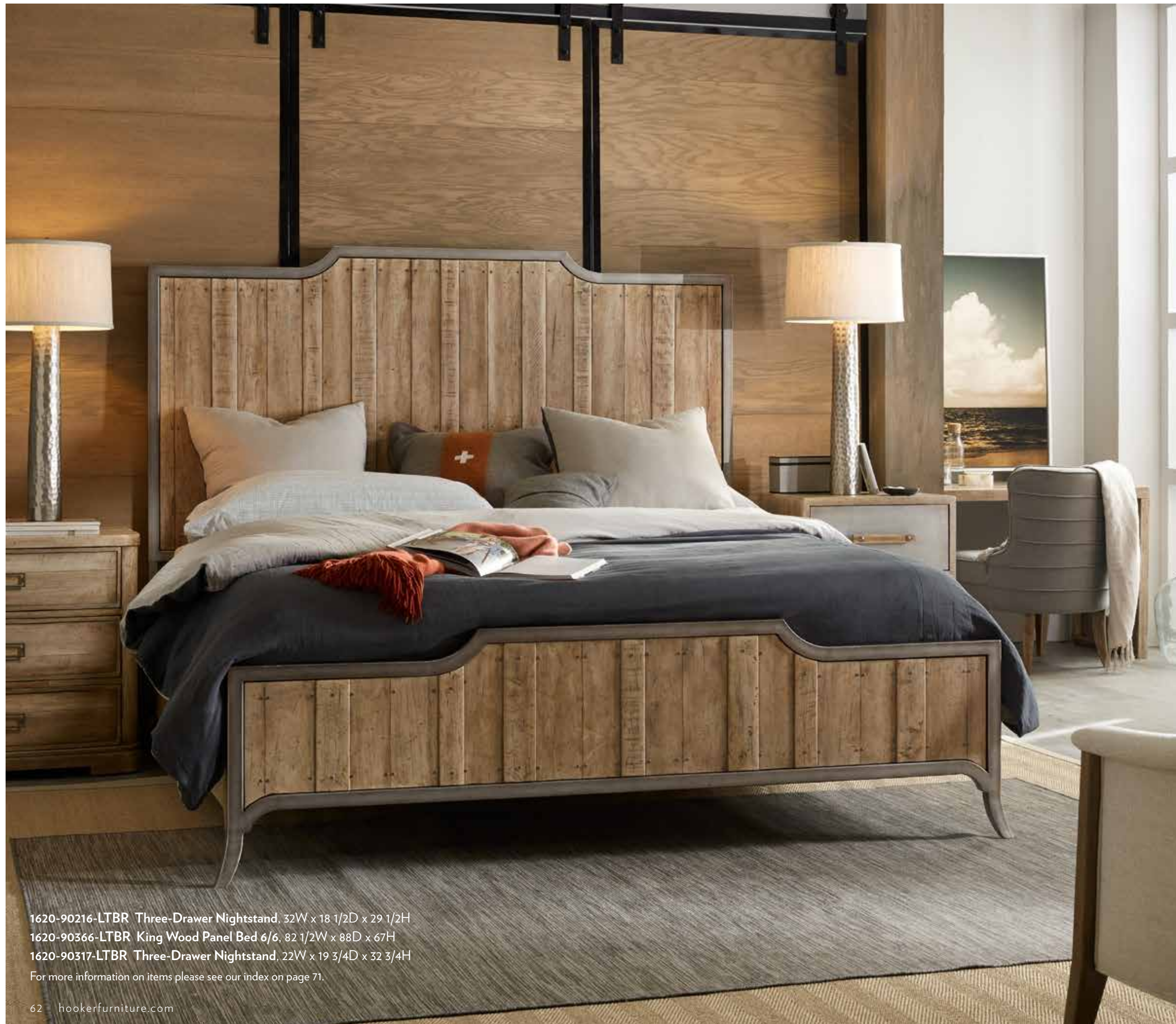
1620-90216-LTBR Three-Drawer Nightstand, 32W x 18 1/2D x 29 1/2H 1620-90366-LTBR King Wood Panel Bed 6/6, 82 1/2W x 88D x 67H 1620-90317-LTBR Three-Drawer Nightstand, 22W x 19 3/4D x 32 3/4H For more information on items please see our index on page 71.