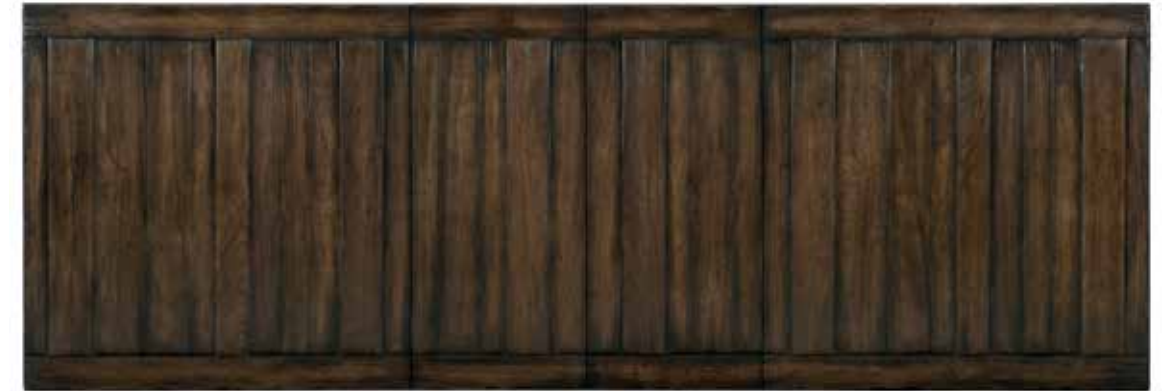
Top View of 1618-75207-DKW Trestle Dining Table with Two 21-inch Leaves extends to 132-inches