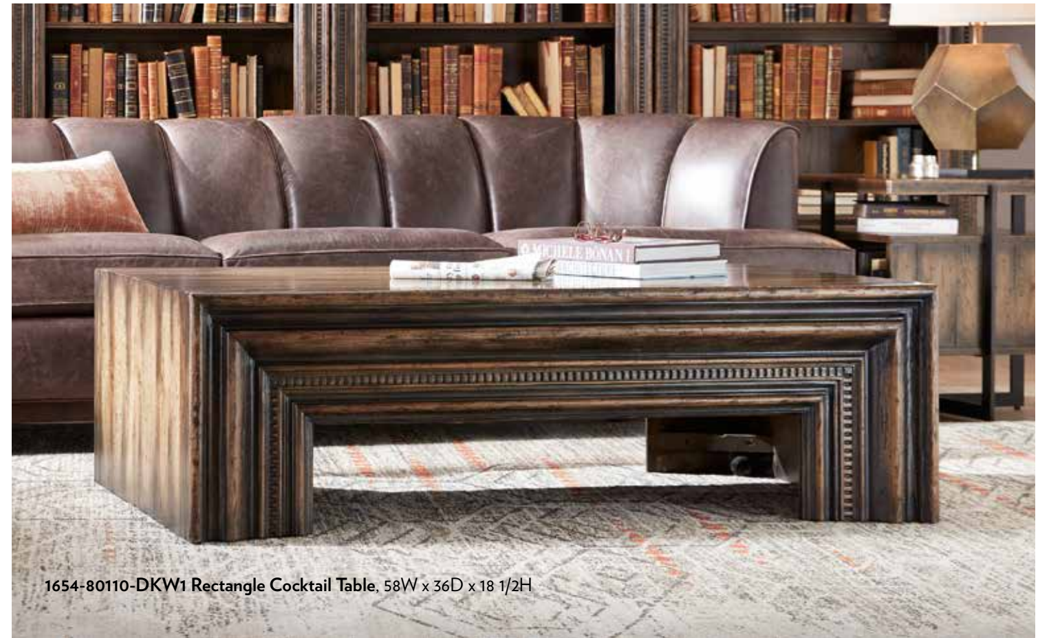
1654-80110-DKW1 Rectangle Cocktail Table, 58W x 36D x 18 1/2H