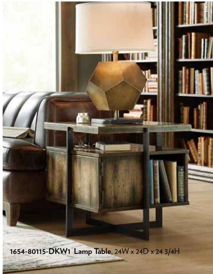
1654-80115-DKW1 Lamp Table, 24W x 24D x 24 3/4H