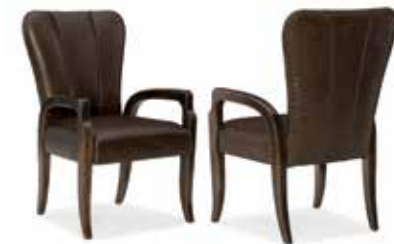
1654-75600-DKW1 Leather Arm Chair Rubberwood and Hardwood Solids with Leather: Bronx Fudge 25W x 26 1/2D x 40 1/2H (64 x 67 x 103 cm) shown on page 19, 23