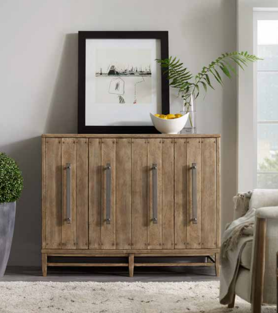
1620-85004-LTBR Four-Door Credenza, 48W x 17 3/4D x 38H For more information on items please see our index on page 70.