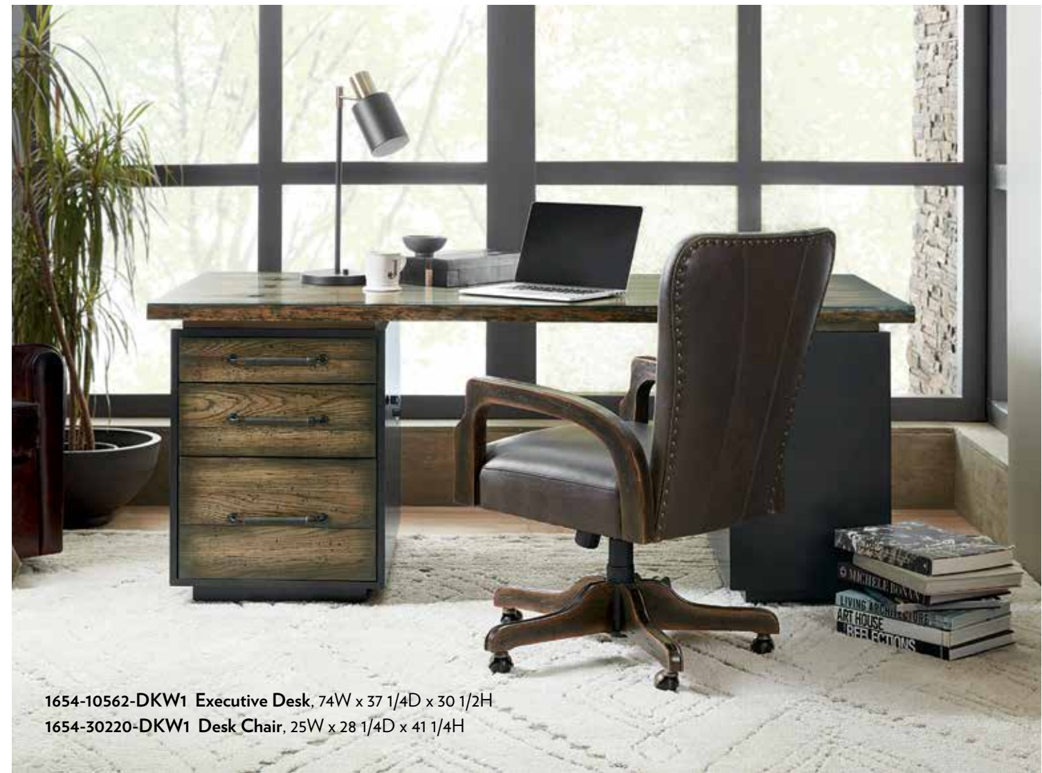
1654-10562-DKW1 Executive Desk, 74W x 37 1/4D x 30 1/2H 1654-30220-DKW1 Desk Chair, 25W x 28 1/4D x 41 1/4H