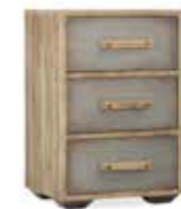
1620-90317-LTBR Three-Drawer Nightstand Poplar and Hardwood Solids with Maple, White Oak and Cedar Veneers and Aluminum Sheet; Three drawers, top has drop in felt liner, bottom has cedar lined bottom, one live USB port and three electrical outlets, cord clip 22W x 19 3/4D x 32 3/4H (56 x 50 x 83 cm) shown on page 60, 63