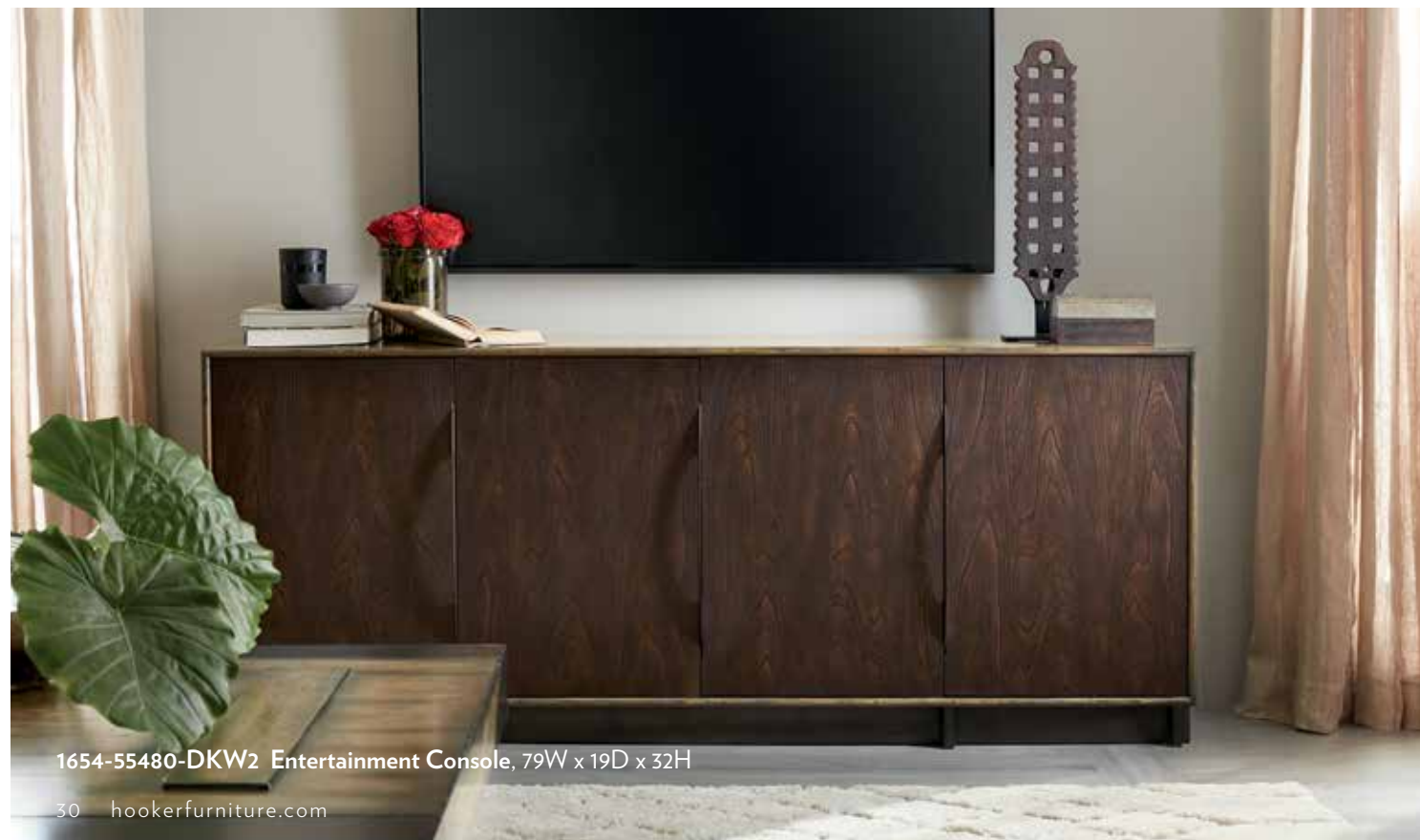
1654-55480-DKW2 Entertainment Console, 79W x 19D x 32H