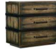
1654-90016B-DKW1 Three-Drawer Nightstand Poplar and Hardwood Solids with Oak Veneer, Aluminum Sheet and Cedar; Top drawer has drop in felt liner, bottom drawer have cedar lined bottom, phone cord clip, power bar with three electrical outlets and one live USB port 32W x 18D x 29 1/2H (81 x 46 x 75 cm) shown on page 27