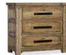
1618-90116-MWD Three-Drawer Nightstand Poplar and Hardwood Solids with Pecan, Maple, Cedar and White Oak Veneers; Three drawers, top has drop in felt liner, bottom has cedar lined bottom, one live USB port and three electrical outlets, three stage touch dimmer switch on each side of case, one light underneath, cord clip 36W x 18 1/2D x 32H (91 x 47 x 81 cm) shown on page 46