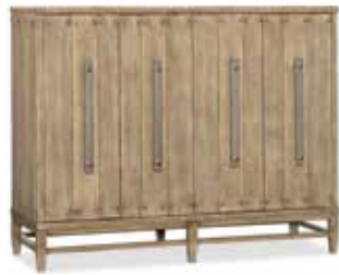
1620-85004-LTBR Four-Door Credenza Poplar, Beech and Hardwood Solids with Maple and White Oak Veneers and Aluminum Sheet; Four doors with one adjustable shelf behind each set, ventilated backpanel, soft close hinges 48W x 17 3/4D x 38H (122 x 45 x 97 cm) shown on back cover