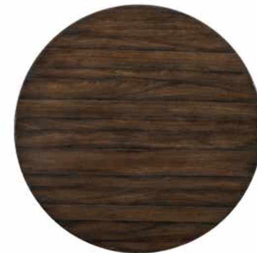
Top View of 1618-75201-DKW 60-inch Round Dining Table