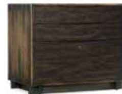
1654-10466-DKW1 Lateral File Poplar Solids with Oak and Elm Veneers and Aluminum Sheet; Two utility drawers, one locking file drawer with Pendaflex letter/legal filing system 36W x 23D x 30H (91 x 58 x 76 cm) shown on page 35