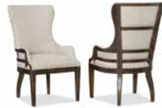
1618-75500-DKW Deconstructed Upholstered Host Chair Rubberwood and Hardwood Solids with Fabric: Abbey 25W x 29 1/4D x 44H (64 x 74 x 112 cm) shown on page 41