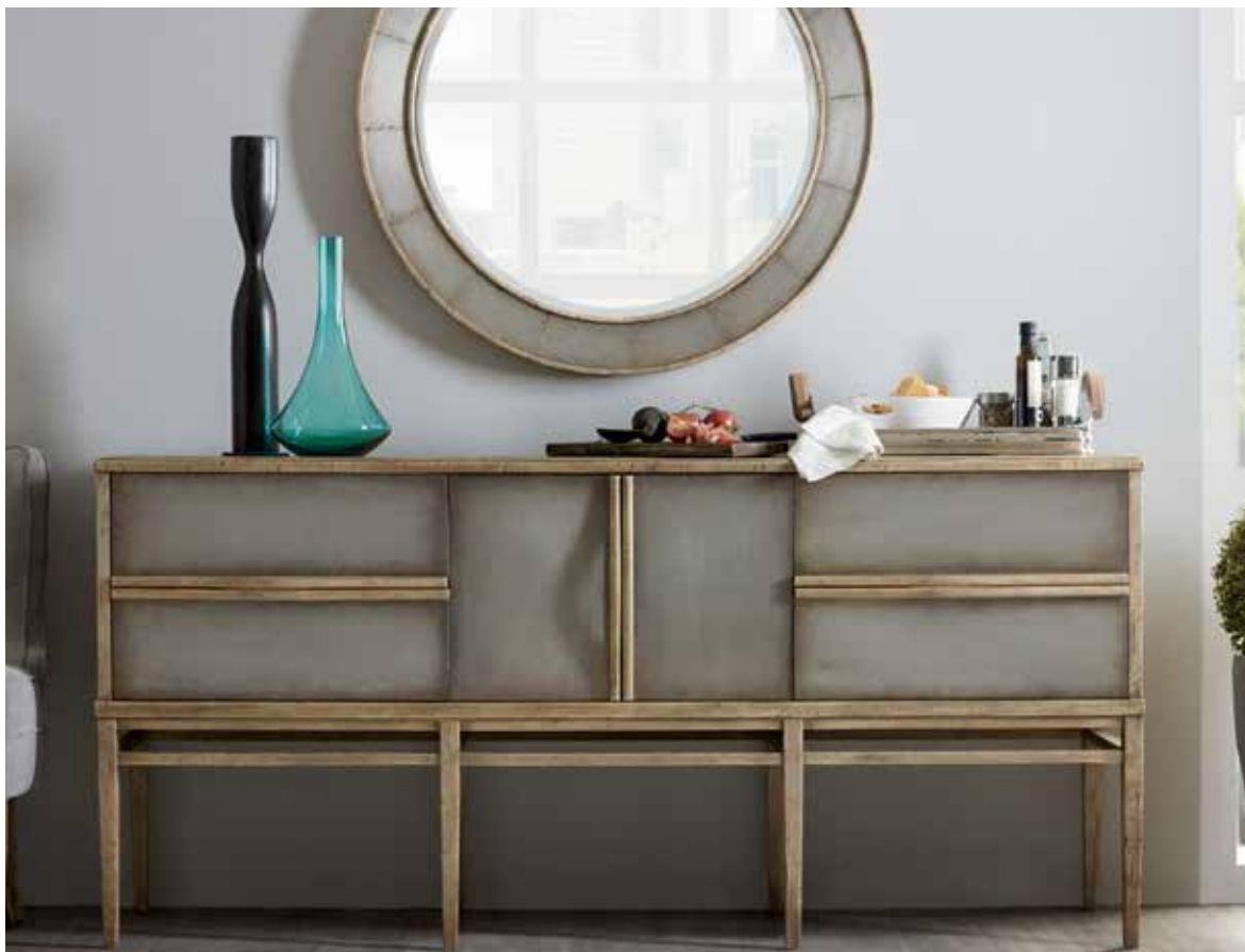
1620-75903-LTBR Sideboard, 74W x 19 1/4D x 34H