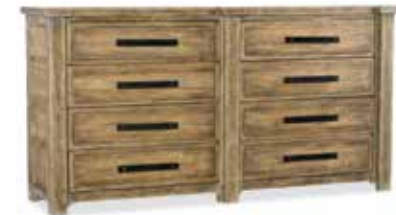
1618-90002-MWD Eight-Drawer Dresser Poplar and Hardwood Solids with Pecan, Cedar, Maple and White Oak Veneers; Eight drawers, top LSF has drop front and drop in felt liner, top RSF has removable felt jewelry tray, both bottom drawers have cedar lined bottom 74W x 19 1/2D x 38H (188 x 50 x 97 cm) shown on page 49