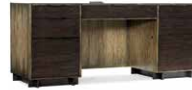
1654-10464-DKW1 Computer Credenza Poplar and Hardwood Solids with Oak and Elm Veneers and Aluminum Sheet; FC627 located in back center of desk (see page 140 for details), seven drawers, center drawer has a drop front for keyboard use, two utility drawers with one removable writing insert and pencil tray for use in either drawer and three removable dividers in each drawer, two utility drawers directly above the two file drawers lock when the file drawer is locked and have three removable dividers, two locking file drawer with Pendaflex letter/legal file system 72W x 25 1/4D x 30H (183 x 64 x 76 cm) shown on page 32, 34