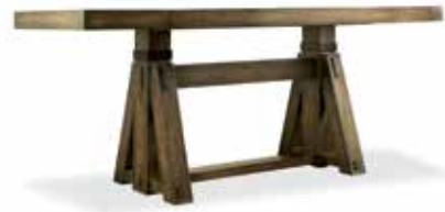
1654-75206-DKW1 Friendship Table with Two 10-inch Leaves Poplar and Hardwood Solids with Oak Veneer and Aluminum Sheet; Table height will adjust from 30" to 36" by adding or removing metal sleeve; With both leaves in place table will accommodate six sides and two arms or eight counter stools 62W x 32D x 30-36H (157 x 81 x 76-91 cm) shown on page 22, 23