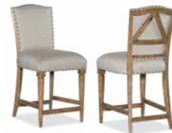
1618-25350A-MWD Deconstructed Counter Stool Rubberwood and Hardwood Solids with Copper and Fabric: Abbey ; Copper foot rest 20 1/2W x 26D x 43 1/4H (52 x 66 x 110 cm)