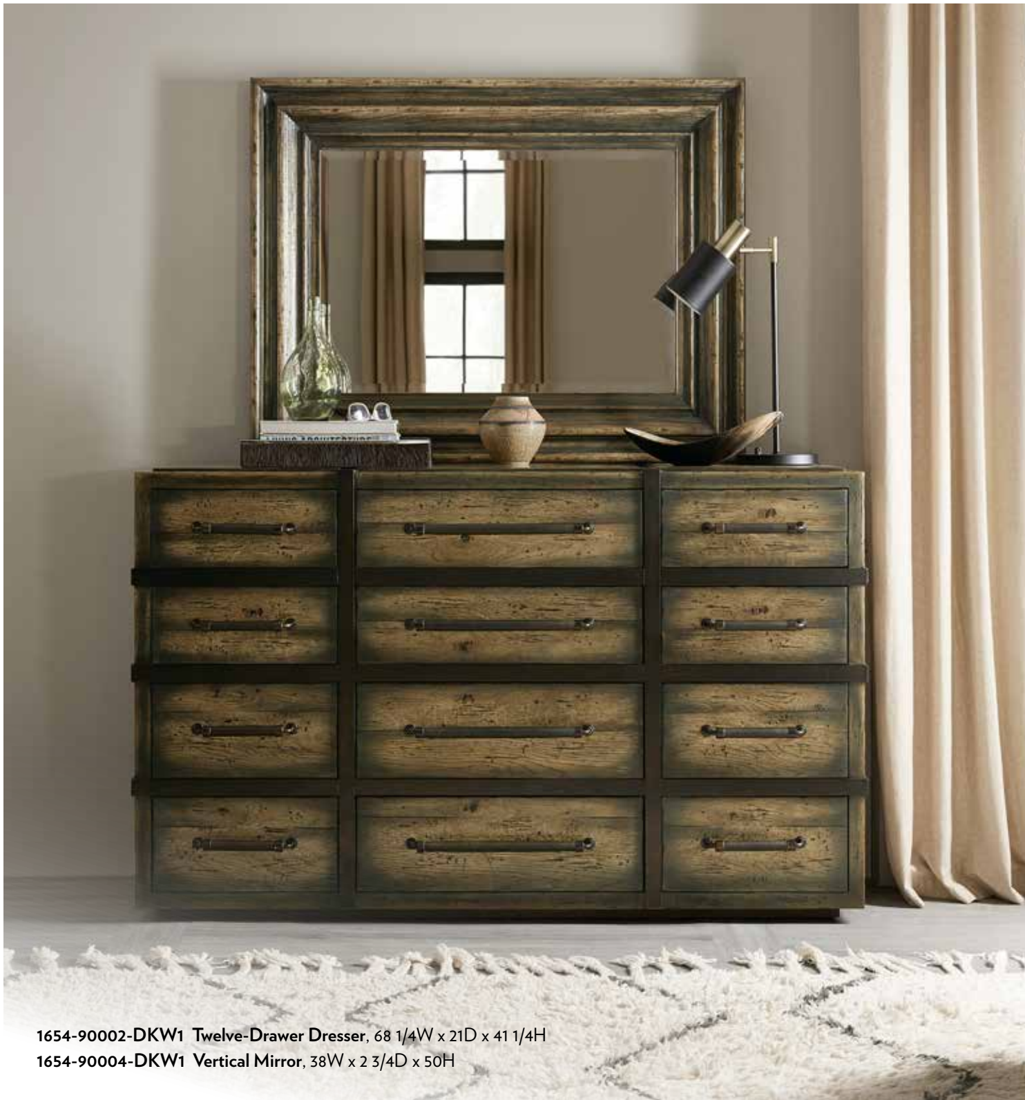
1654-90002-DKW1 Twelve-Drawer Dresser, 68 1/4W x 21D x 41 1/4H 1654-90004-DKW1 Vertical Mirror, 38W x 2 3/4D x 50H