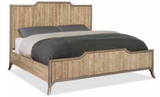
Wood Panel Bed Poplar, Maple and Hardwood Solids with Maple Veneer, Metal and Nailheads; Headboard height is adjustable, Lowest setting: 59 1/4" (150 cm) Highest setting: 67" (170 cm)