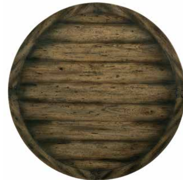
Top View of 1654-75203-DKW1 54-inch Round Dining Table