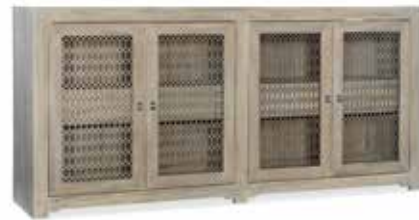
1672-75900-80 Four-Door Buffet Poplar and Hardwood Solids with Pecan Veneer Four wood framed doors with decorative metal insets, one fixed shelf behind each set of doors, one drawer behind each set of doors with one drop in felt liner and one drop in silver tray, soft close hinges 85W x 20D x 40H (216 x 51 x 102 cm) shown on page 5, 6