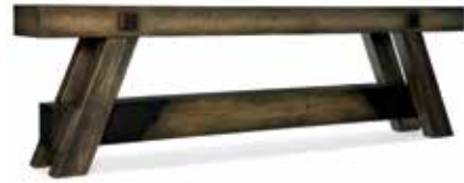
1654-85003-DKW1 Console Poplar and Hardwood Solids with Oak Veneer and Aluminum sheet 105W x 17 3/4D x 32 1/4H (267 x 45 x 82 cm) shown on page 31