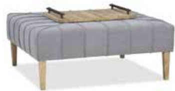
1620-80110-LTBR Square Ottoman/Cocktail Table Poplar, Maple and Hardwood Solids with Maple Veneer and Fabric: Castle; Removable tray included. 40 1/2W x 40 1/2D x 17H (103 x 103 x 43 cm) shown on page 68, 69