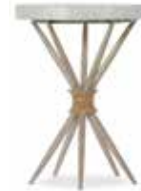
1672-50003-00 Accent Table Beech Solids with Capiz Shell and Rope 18W x 18D x 24H (46 x 46 x 61 cm) shown on page 13