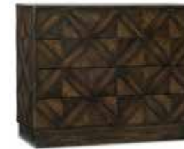
1618-90017-DKW Four-Drawer Bachelor's Chest Poplar and Hardwood Solids with Black Walnut, Maple, Cedar and White Oak Veneers; Four drawers, top has drop in felt liner, bottom has cedar lined bottom, one live USB port and three electrical outlets, cord clip 42W x 19D x 34 1/4H (107 x 48 x 87 cm) shown on page 49