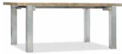
1620-75200-LTBR 72-inch Metal Leg Table with Two 22-inch Leaves Poplar, Maple and Hardwood Solids with Aluminum Sheet; Will seat 10 with both leaves in place. Note that the 1620-75800-LTBR chairs will only go approximately 12" under the table apron. Table extends to 116" (295 cm) with both leaves in place 72W x 40D x 30H (183 x 102 x 76 cm) shown on page 65