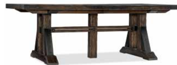
1618-75207-DKW Trestle Dining Table with Two 21-inch Leaves Poplar and Hardwood Solids with Black Walnut Veneer and Aluminum Sheet; Includes a rail system for adding/removing leaves that will cause the support legs to move in/out. Server tray included with table.; Will seat twelve with both leaves in place. Will seat eight with no leaves in place. Table extends to 132" (335 cm) with both leaves in place. 90W x 44 1/4D x 30 1/4H (229 x 112 x 77 cm) shown on page 40, 41