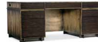
1654-10563-DKW1 Executive Desk Poplar and Hardwood Solids with Oak Veneer Seven drawers, center drawer has drop front for keyboard use, two utility drawers with one removable writing insert and one pencil tray for use in either drawer and two removable dividers, two drawers with two removable dividers in each, they both lock when the file drawer below is locked, two locking file drawers with Pendaflex letter/legal file system 73W x 37 1/4D x 30H (185 x 95 x 76 cm) shown on page 32, 33