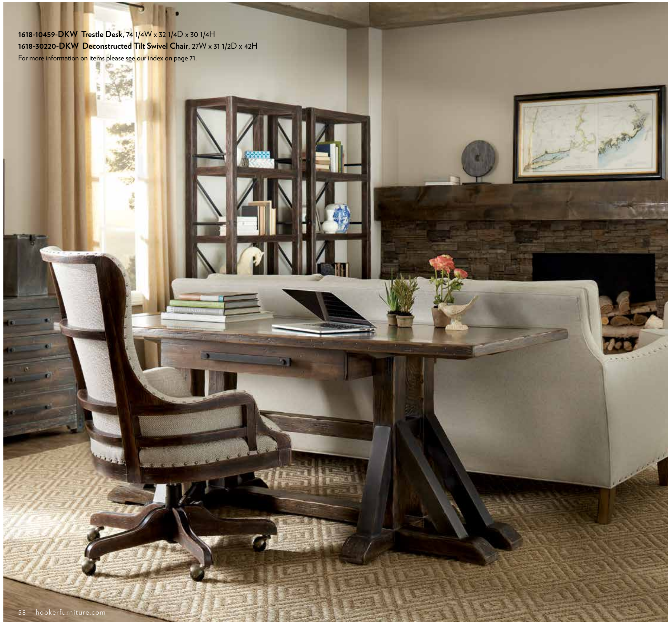
1618-10445-DKW Etagere, 34 1/2W x 16 1/2D x 80 1/4H

1618-10459-DKW Trestle Desk, 74 1/4W x 32 1/4D x 30 1/4H 1618-30220-DKW Deconstructed Tilt Swivel Chair, 27W x 31 1/2D x 42H For more information on items please see our index on page 71.