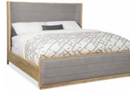
Upholstered Bed Poplar and Hardwood Solids with Maple Veneer and Fabric: Castle