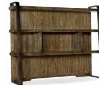
1654-10467-DKW1 Computer Credenza Hutch Poplar and Hardwood Solids with Oak and Elm Veneer and Aluminum Sheet; Two fixed shelves, second shelf has two fixed dividers 71 1/2W x 18D x 58 1/4H (181 x 46 x 148 cm) shown on page 32, 34