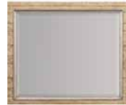
1620-90009-LTBR Landscape Mirror Maple and Hardwood Solids with Mirror 46W x 4 1/2D x 39H (117 x 11 x 99 cm) shown on page 61