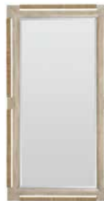
1672-50004-80 Floor Mirror Poplar and Hardwood Solids with Beveled mirror 43W x 2D x 81 3/4H (109 x 5 x 208 cm) shown on page 13