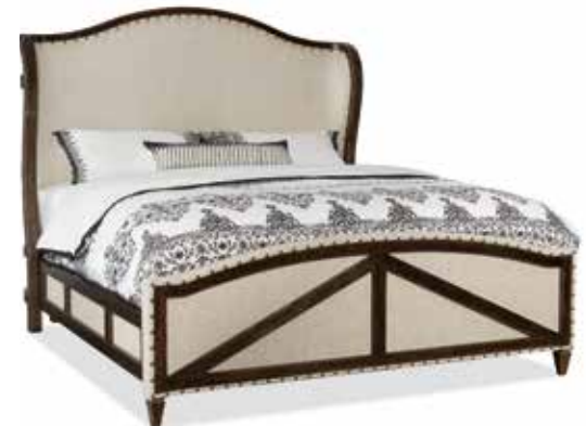
Deconstructed Upholstered Bed Poplar and Hardwood Solids with Black Walnut Veneers, Fabric: Abbey and Nailheads; Bed is designed to float in a room, back of headboard has gimp welt.