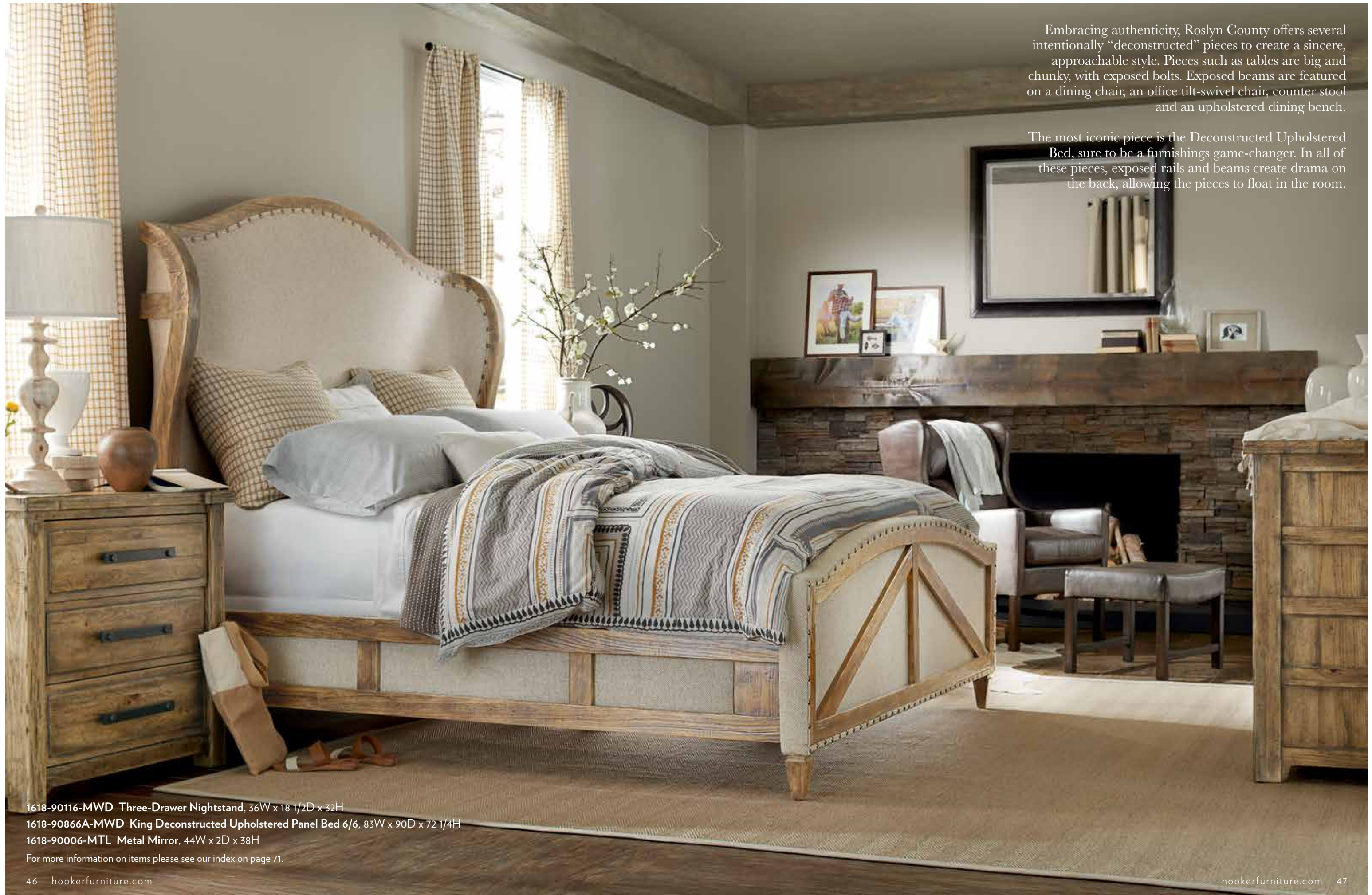
1618-90116-MWD Three-Drawer Nightstand, 36W x 18 1/2D x 32H

The most iconic piece is the Deconstructed Upholstered Bed, sure to be a furnishings game-changer. In all of these pieces, exposed rails and beams create drama on the back, allowing the pieces to float in the room.