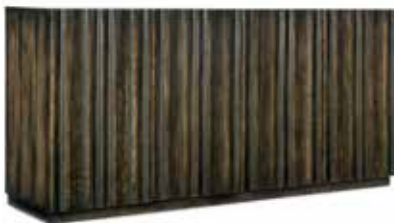
1654-75900-DKW1 Buffet Poplar and Hardwood Solids with Oak Veneer Four doors with two adjustable shelves behind each set of doors, ventilation in both sections, soft close hinges; TV Ready 72 1/4W x 19 1/4D x 34 1/4H (184 x 49 x 87 cm) shown on page 19