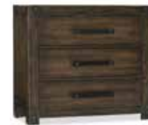
1618-90015A-DKW Three-Drawer Nightstand Poplar and Hardwood Solids with Black Walnut, Cedar, Maple and White Oak Veneers; Three drawers, top has drop in felt liner, bottom has cedar lined bottom, one live USB port and three electrical outlets, three stage touch dimmer switch on each side of case, one light underneath, cord clip 36W x 18 3/4D x 32 1/4H (91 x 48 x 82 cm) shown on page 51