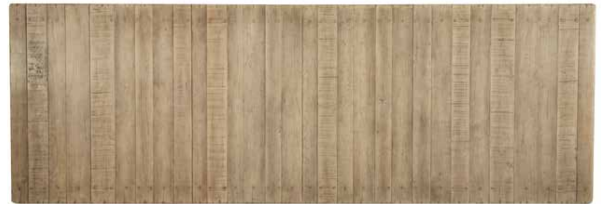
Top View of 1620-75200-LTBR 72-inch Metal Leg Table with Two 22-inch Leaves extends to 116-inches