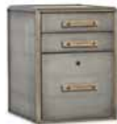
1620-10412-LTBR Mobile File Poplar and Harwood Solids with Maple Veneer, Aluminum Sheet, Nailhead and Casters; Two utility drawers, one locking file drawer with Pendaflex letter/legal file system, finished on back 18 1/2W x 22D x 25H (47 x 56 x 64 cm)