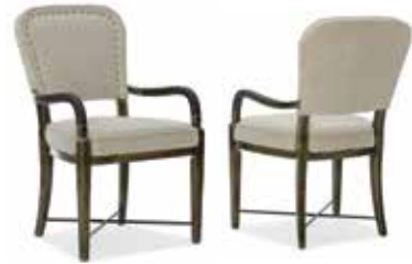
1654-75400-DKW1 Upholstered Arm Chair Rubberwood and Hardwood Solids with, Leather and Nailheads, Fabric: Merit Dove Performance Fabric 23 1/4W x 23D x 38H ( 59 x 58 x 97 cm) shown on page 16