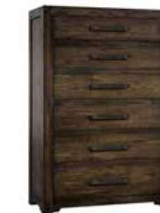
1618-90010-DKW Six-Drawer Chest Poplar and Hardwood Solids with Black Walnut, Cedar, Maple and White Oak Veneers; Six drawers, top drawer has drop in felt liner, bottom drawer had cedar lined bottom 42W x 21D x 63H (107 x 53 x 160 cm)