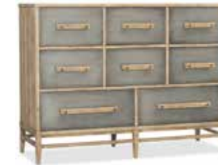
1620-90203-LTBR Eight-Drawer Bureau Maple and Hardwood Solids with Maple, White Oak and Cedar Veneers and Aluminum Sheet; Eight Drawers are all metal wrapped, top LSF drawer has drop front and drop in felt liner, top middle drawer has drop in felt liner, top RSF drawer has removable felt jewelry tray, both bottom drawers have cedar lined bottom 56W x 20 3/4D x 42H (142 x 53 x 107 cm) shown on page 63