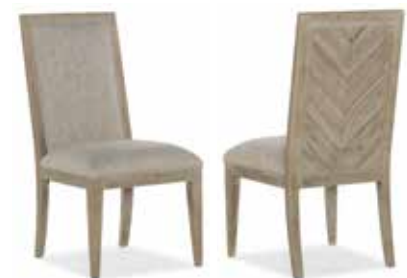
1672-75311-80 Upholstered Side Chair Rubberwood Solids with Pecan Veneer and Fabric: Terrus Gray 20 1/4W x 26D x 40 1/2H (51 x 66 x 103 cm) shown on page 2, 3, 4