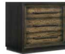
1654-90016-DKW1 Three-Drawer Nightstand Poplar Solids with Oak Veneer and Aluminum Sheet; Top drawer has drop in felt liner, bottom drawer have cedar lined bottom, phone cord clip, power bar with three electrical outlets and one live USB port 32W x 19D x 29 1/4H (81 x 48 x 74 cm) shown on page 27