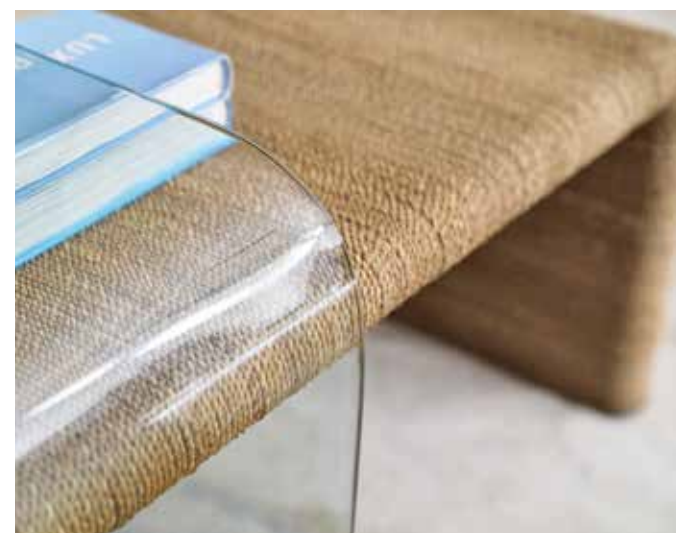
1672-50001-02 Spot Accent Table 16W x 16D x 24H