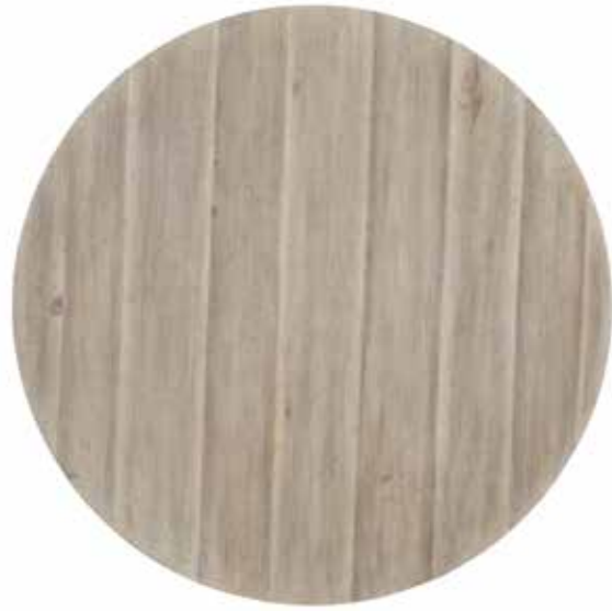
Top View of 1672-75203-80 48-inch Round Pedestal Dining Table