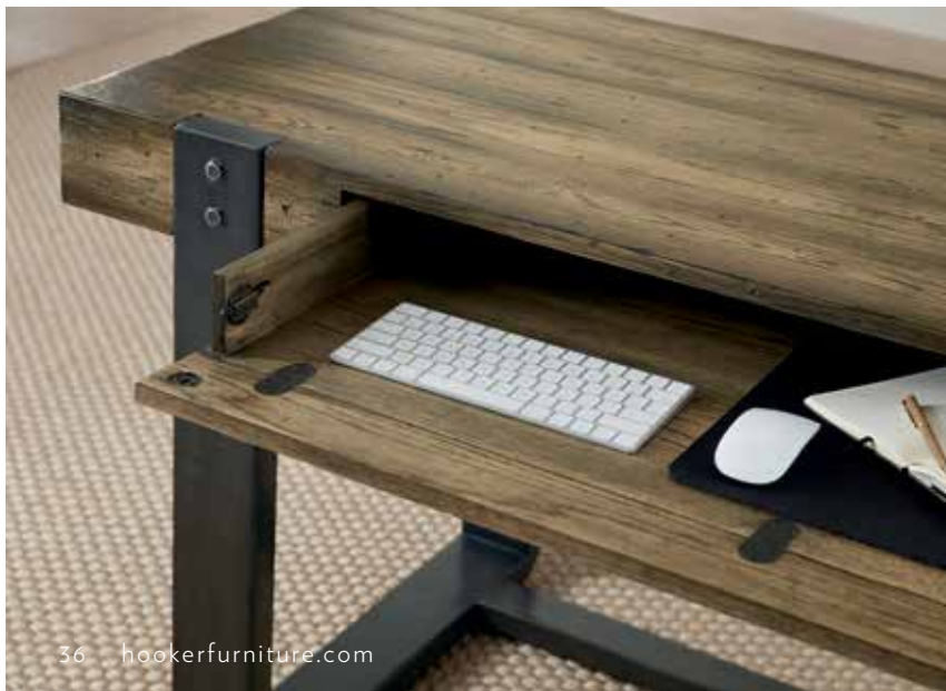
1654-10364-DKW1 Leg Desk Credenza 84W x 25 3/4D x 30H