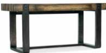
1654-10458-DKW1 Leg Desk Poplar and Hardwood Solids with Oak and Elm Veneer and Aluminum Sheet; One drawer with drop front for keyboard use, finished on all sides, legs and stretcher is metal wrapped, can be used left or right of the Leg Desk Credenza 66W x 24D x 30H (168 x 61 x 76 cm) shown on page 36, 37