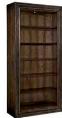
1654-10443-DKW1 Bookcase Poplar and Hardwood Solids with Oak Veneer; Five shelves, top shelf is wood framed glass, 2nd, 3rd and 5th shelves are adjustable wood, 4th shelf is a fixed wood shelf, light with three-intensity touch switch 42W x 16D x 84H (107 x 41 x 213 cm) shown on page 21, 38