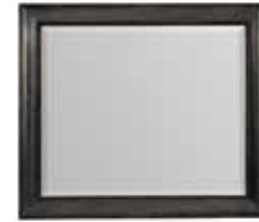
1618-90006-MTL Metal Mirror Poplar and Hardwood Solids with Mirror and Aluminum Sheet; Beveled Mirror 44W x 2D x 38H (112 x 5 x 97 cm) shown on page 47, 49