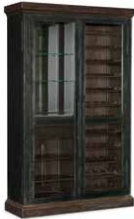
1618-75917-DKW Wine Cabinet Poplar and Hardwood Solids with Black Walnut and White Oak Veneer, Seeded Glass, Antique Mirror, Aluminum Sheet and Pebble Stone Two metal wrapped wood framed seeded glass doors, one drawer with drop in felt liner, two adjustable shelves behind LSF door, ten adjustable/reversible shelves behind RSF door (flat on one side and wine rack that holds up to six bottles on the opposite side), two fixed shelves on RSF (3rd and 8th from the top), two adjustable glass shelves, removable back panel in the LSF lower section to add a wine cooler (cooler will protrude slightly out the back of the unit) one electrical outlet, one light, pebble stone work surface, five slot wine glass rack in upper LSF section, RSF will hold up to 60 bottles of wine 54W x 18 1/4D x 85H (137 x 46 x 216 cm) shown on page 43