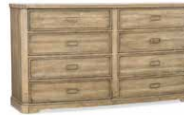
1620-90202-LTBR Eight-Drawer Dresser Poplar, Maple and Hardwood Solids with Maple, White Oak and Cedar Veneers; Eight drawers, top LSF drawer has drop in felt liner, drop front, top RSF drawer has removable felt jewelry tray, both bottom drawers have cedar lined bottom 68W x 19D x 38H (173 x 48 x 97 cm) shown on page 61