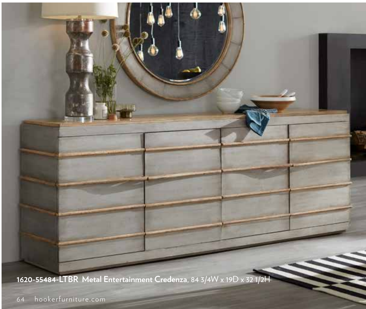
1620-55484-LTBR Metal Entertainment Credenza, 84 3/4W x 19D x 32 1/2H