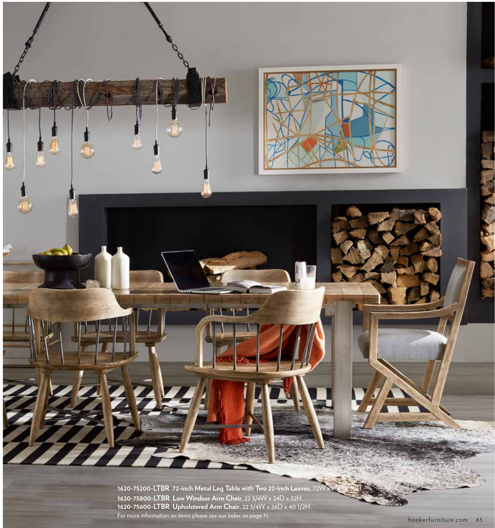
1620-75200-LTBR 72-inch Metal Leg Table with Two 22-inch Leaves, 72W x 40D x 30H