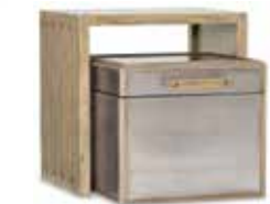
1620-50001-LTBR Nesting/Storage Table Poplar and Hardwood Solids with Maple Veneer, Aluminum Sheet and Nailheads; Storage box has casters, table and storage box is finished on back the same as the front. Storage box: 19 7/8W x 18D x 18H (50 x 46 x 46 cm) Table: 24W x 18D x 24 1/4H (61 x 46 x 62 cm) shown on page 68, 69