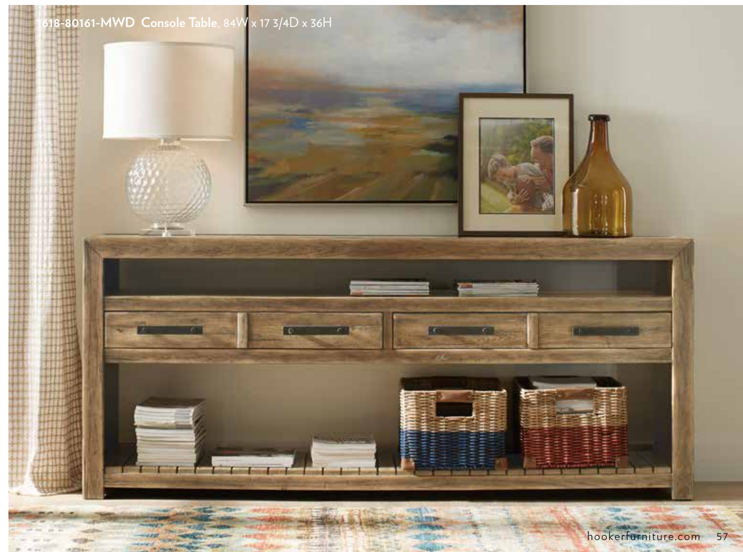
1618-80161-MWD Console Table, 84W x 17 3/4D x 36H