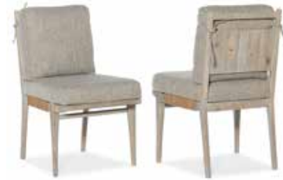
1672-75312-80 Upholstered Side Chair Rubberwood Solids with Fabric: Terrus Gray 21W x 25 1/2D x 34 1/2H (53 x 65 x 88 cm) shown on page 6