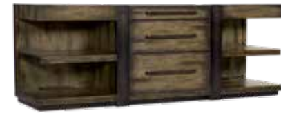
1654-10364-DKW1 Leg Desk Credenza Poplar and Hardwood Solids with Oak Veneer, Leather and Aluminum Sheet; Two Utility drawers, one file drawer with Pendaflex Letter/Legal file system, two open shelves on each side, finished back, post are metal wrapped 84W x 25 3/4D x 30H (213 x 65 x 76 cm) shown on page 36, 37