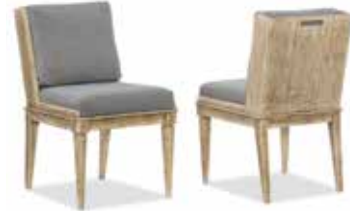
1620-75410-LTBR Upholstered Side Chair Rubberwood and hardwood Solids with Maple Veneer and Fabric: Castle 21 1/4W x 26D x 35H (54 x 66 x 89 cm) shown on page 66, 67