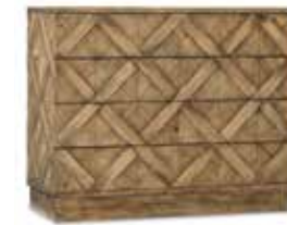
1618-90017A-MWD Four-Drawer Bachelor's Chest Poplar and Hardwood Solids with Black Walnut, Maple, Cedar and White Oak Veneer; Four drawers, top has drop in felt liner, bottom has cedar lined bottom, one live USB port and three electrical outlets, cord clip 42W x 19D x 34H (107 x 48 x 86 cm) shown on page 48