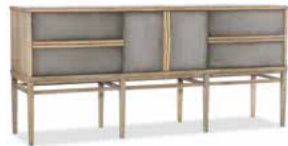
1620-75903-LTBR Sideboard Poplar, Maple, Beech and Hardwood Solids with Maple and White Oak Veneers and Aluminum Sheet; Two doors with one adjustable shelf behind, four drawers, ventilated backpanel, soft close hinges 74W x 19 1/4D x 34H (188 x 49 x 86 cm) shown on page 64, 67