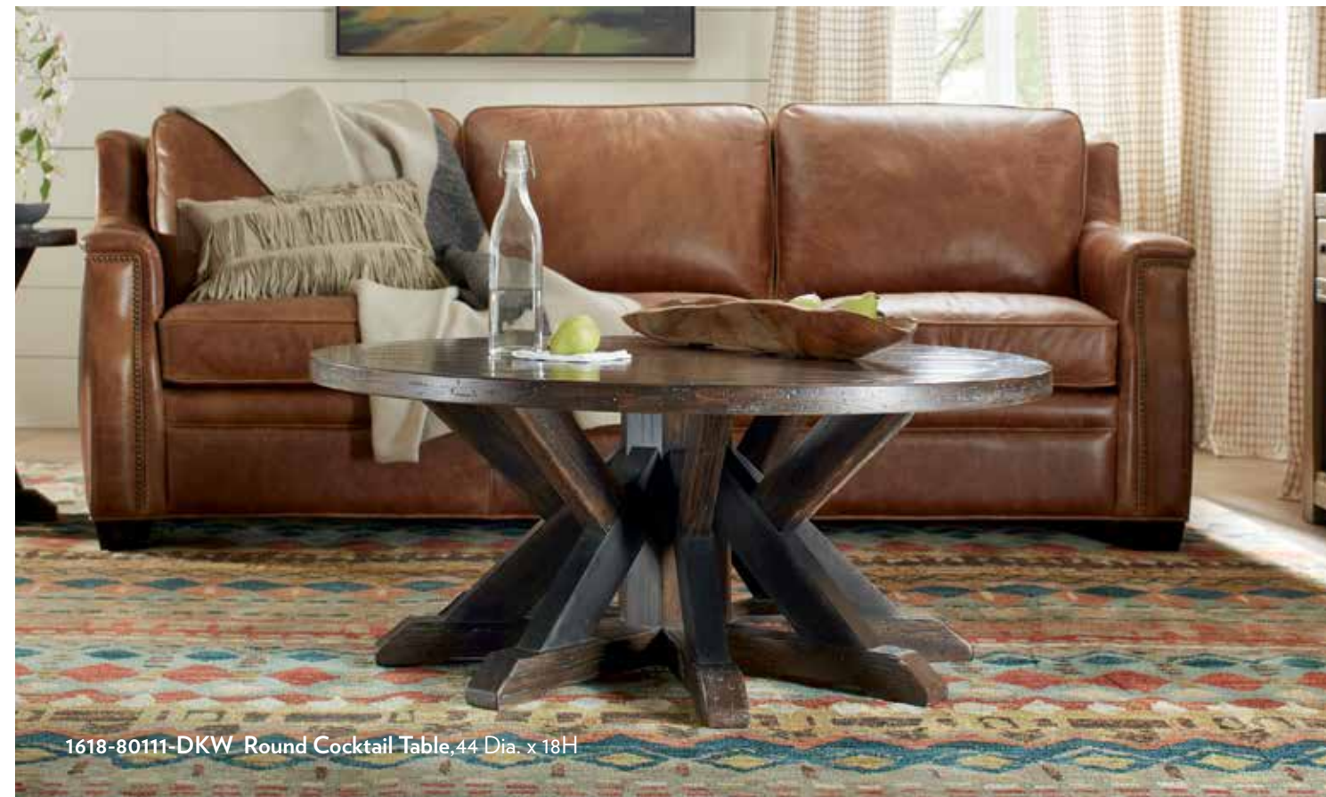
1618-80111-DKW Round Cocktail Table, 44 Dia. x 18H