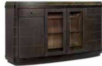
1654-75160-DKW1 His and Her Bar Poplar and Hardwood Solids with Oak Veneer, Gold Leaf, Glass, Leather, Nailheads and Aluminum Sheet; Four doors, two leather wrapped doors with nailheads, two leather wrapped (frame) seeded glass doors, two drawers, LSF door has four adjustable wood shelves that can be flipped to use as wine storage with four slots on each shelf (top shelf will only accommodate three bottles) or can be use as a regular shelf, RSF door has two adjustable wood shelves, center set of doors had two adjustable glass shelves and one adjustable half size glass shelf, one light in center section 68W x 19D x 38H (173 x 48 x 97 cm) shown on page 18