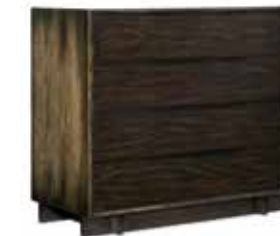
1654-90017-DKW1 Four-Drawer Bachelor's Chest Poplar and Hardwood Solids with Oak and Elm Veneers, Gold Leaf, Aluminum Sheet; Top drawer has drop in felt liner, bottom drawer have cedar lined bottom, phone cord clip, power bar with three electrical outlets and one live USB port 39W x 18D x 34H (99 x 46 x 86 cm) shown on page 24, 25, 27