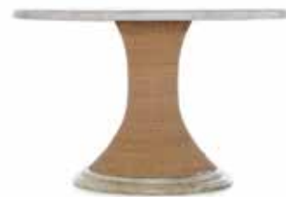
1672-75204-00 48-inch Round Pedestal Dining Table Poplar and Hardwood Solids with Resin, Rope and Marble; Will accommodate up to five chairs from the Amani Collection, marble top 48 Dia. x 30H (122 x 122 x 76 cm) shown on page 2, 3