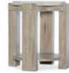
1672-80116-00 Round End Table Poplar and Hardwood Solids with Pecan Veneer and Marble; One fixed shelf 23 Dia. x 25 1/4H (58 x 58 x 64 cm) shown on page 9, 10