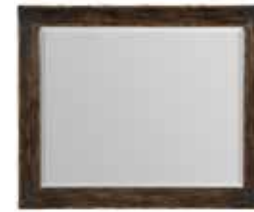
1618-90008-DKW Landscape Mirror Poplar and Hardwood Solids with Mirror Beveled Mirror 46W x 3D x 37 3/4H (117 x 8 x 96 cm) shown on page 50