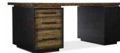
1654-10562-DKW1 Executive Desk Poplar and Hardwood Solids with Oak Veneer and Aluminum Sheet and Leather; Three drawers, top drawer has a removable pencil tray and three removable dividers, second drawer has three removable dividers, third drawer has letter/legal Pendaflex filing system, one pedestal lock that locks the second and third drawers, one adjustable shelf located in the bookcase pedestal, both pedestals are aluminum sheet wrapped Can be used as a partners desk. 74W x 36D x 30H (188 x 91 x 76 cm) Consists of: 1654-10001-DKW1 Left Drawer Pedestal 20 1/2W x 32 1/4D x 27 3/4H (52 x 82 x 70 cm) 1654-10002-DKW1 Bookcase Pedestal 16W x 32 1/4D x 27 3/4H (41 x 82 x 70 cm) 1654-10003-DKW1 Executive Desk Top 74W x 36D x 2 3/4H (188 x 91 x 7 cm) shown on page 39