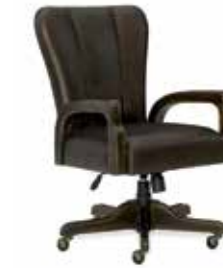
1654-30220-DKW1 Desk Chair Rubberwood and Hardwood Solids with Leather: Bronx Fudge; Tilt swivel pneumatic gas lift 26 1/2W x 27 1/2D x 40H (67 x 70 x 102 cm) shown on page 32, 34, 36, 37