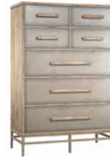
1620-90210-LTBR Seven-Drawer Chest Poplar, Beech and Hardwood Solids with Maple, White Oak and Cedar Veneers and Aluminum Sheet; Seven drawers, both top drawers have drop in felt liner, bottom drawer has cedar lined bottom 40W x 20 3/4D x 59 1/2H (102 x 53 x 151 cm)