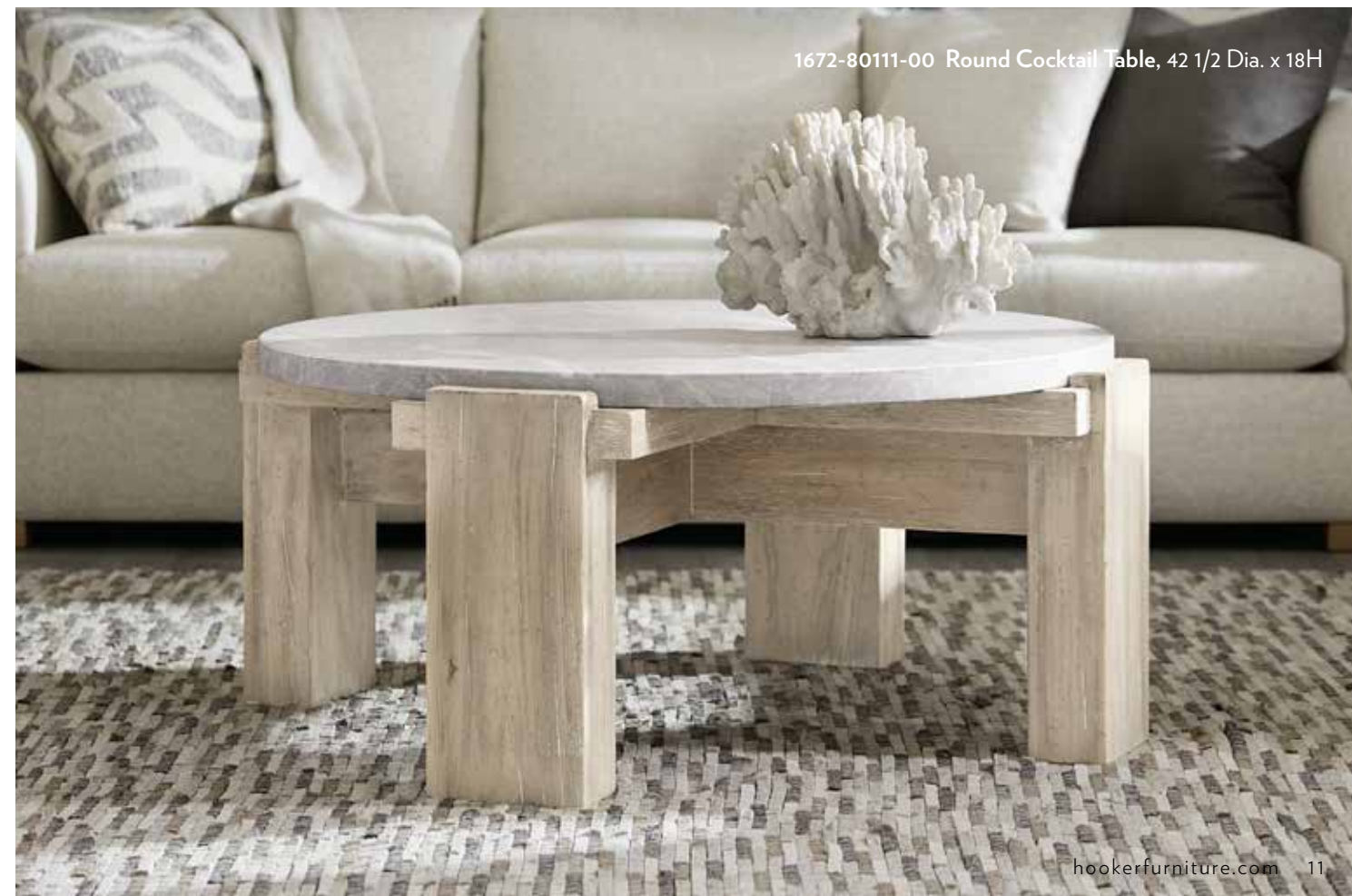
1672-80111-00 Round Cocktail Table, 42 1/2 Dia. x 18H