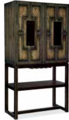
1654-75260-DKW1 Bar Cabinet Poplar and Hardwood Solids with Oak Veneer, Seeded Glass, Soapstone and Mirror; Two doors that wrap to the side of the case, each door has three felt lined storage sections, two adjustable glass shelves (one is half size), mirror back panel, light with touch switch, levelers, soapstone work surface, four slots underneath cabinet to hang wine glasses, one fixed wood shelf 42W x 20D x 78 1/4H (107 x 51 x 199 cm) shown on page 20, 21