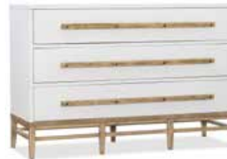
1620-90101-WH Bachelor's Chest Maple, Beech and Hardwood Solids with Maple, White Oak and Cedar Veneers; Three drawers, top two drawers have two removable dividers, bottom drawer has one removable divider and cedar lined bottom 54W x 19 3/4D x 36H (137 x 50 x 91 cm) shown on page 63, 66