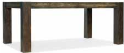
1654-75200-DKW1 Rectangle Dining Table with Two 20-inch Leaves Poplar and Hardwood Solids with Oak and Elm Veneer; With both leaves in place table will accommodate eight sides and two arms; Also will accommodate 10 of the 1654-75800-DKW1 Arm Chairs 116W x 44D x 30 1/4 with both leaves in place (295 x 112 x 77 cm) 80W x 44D x 30 1/4H (203 x 112 x 77 cm) shown on page 16, 17