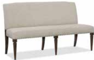
1618-75019-DKW Upholstered Dining Bench Rubberwood and Hardwood Solids with Fabric: Abbey 69W x 24 3/4D x 38 1/4H (175 x 63 x 97 cm) shown on page 40