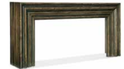
1654-85001-DKW1 Hall Console Poplar and Hardwood Solids with Oak Veneer 72W x 14D x 36H (183 x 36 x 91 cm) shown on page 30