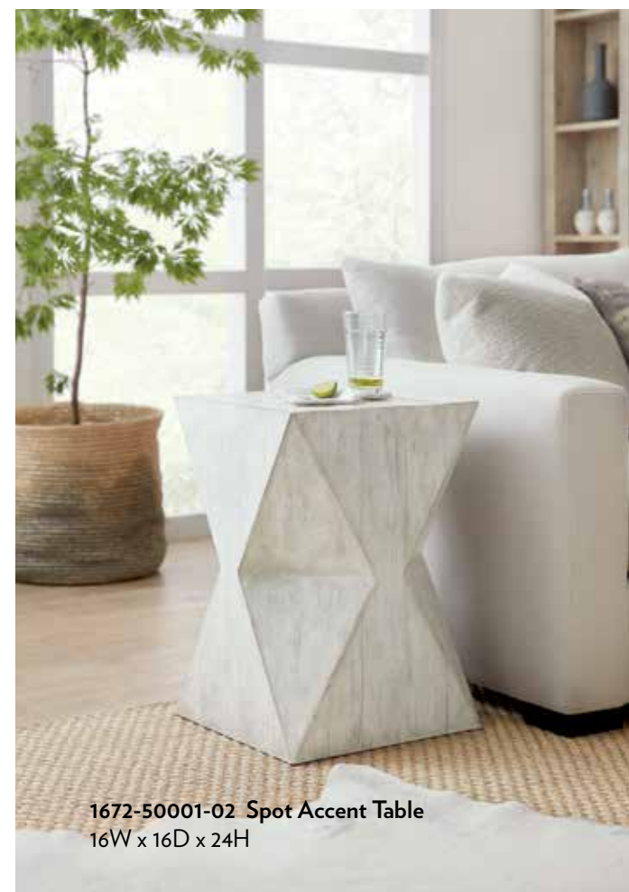
1672-50001-02 Spot Accent Table 16W x 16D x 24H