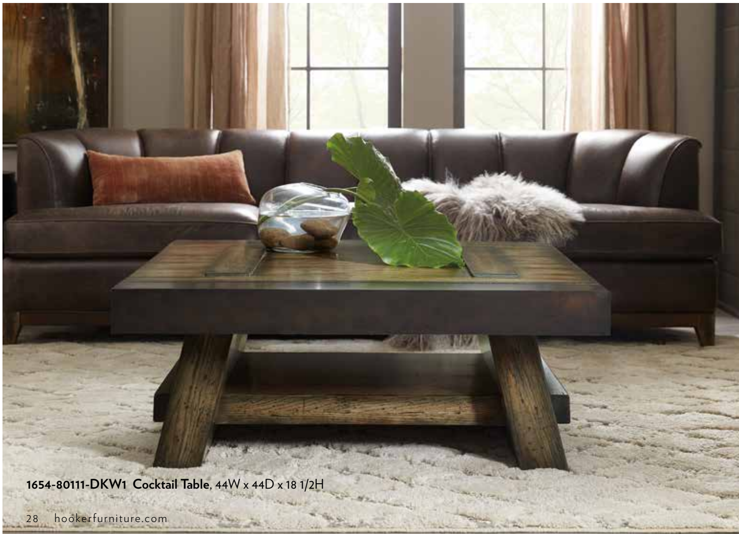
1654-80111-DKW1 Cocktail Table, 44W x 44D x 18 1/2H