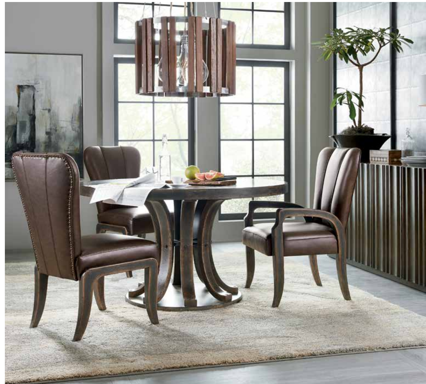
1654-75203-DKW1 54-inch Round Dining Table 54 Dia. x 30 3/4H