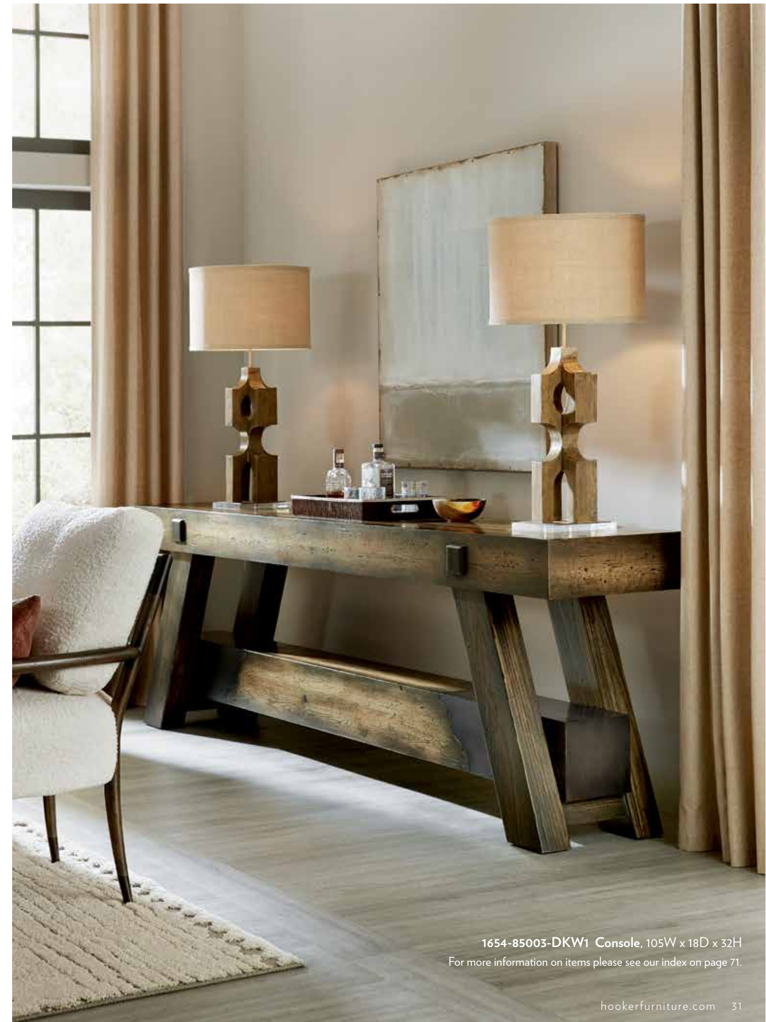
1654-85003-DKW1 Console, 105W x 18D x 32H For more information on items please see our index on page 71.