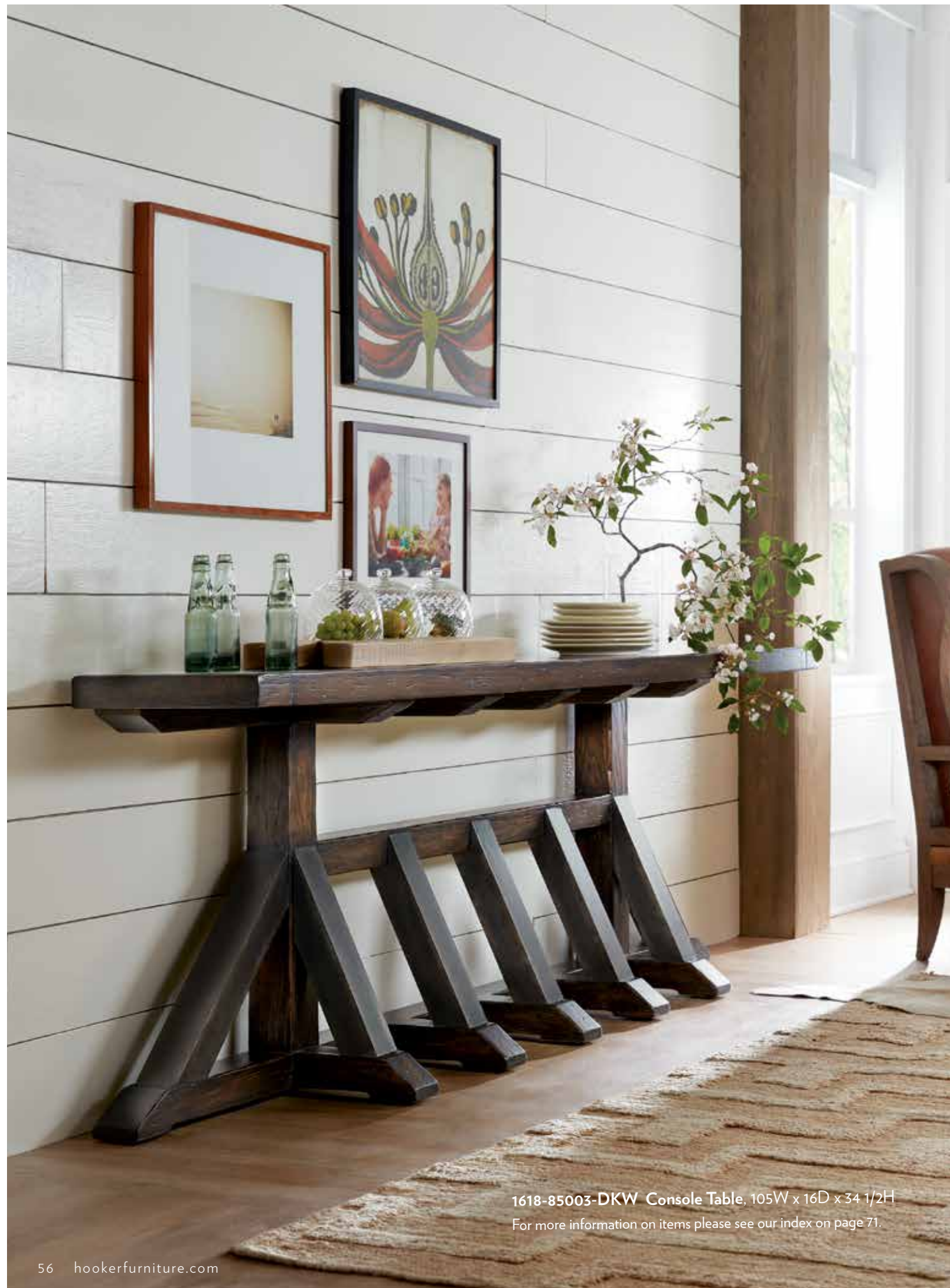
1618-85003-DKW Console Table, 105W x 16D x 34 1/2H For more information on items please see our index on page 71.