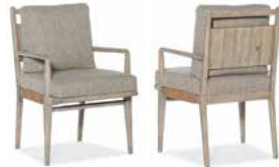
1672-75302-80 Upholstered Arm Chair Rubberwood Solids with Fabric: Terrus Gray 22 3/4W x 25 1/2D x 34 1/2H (58 x 65 x 88 cm) shown on page 7