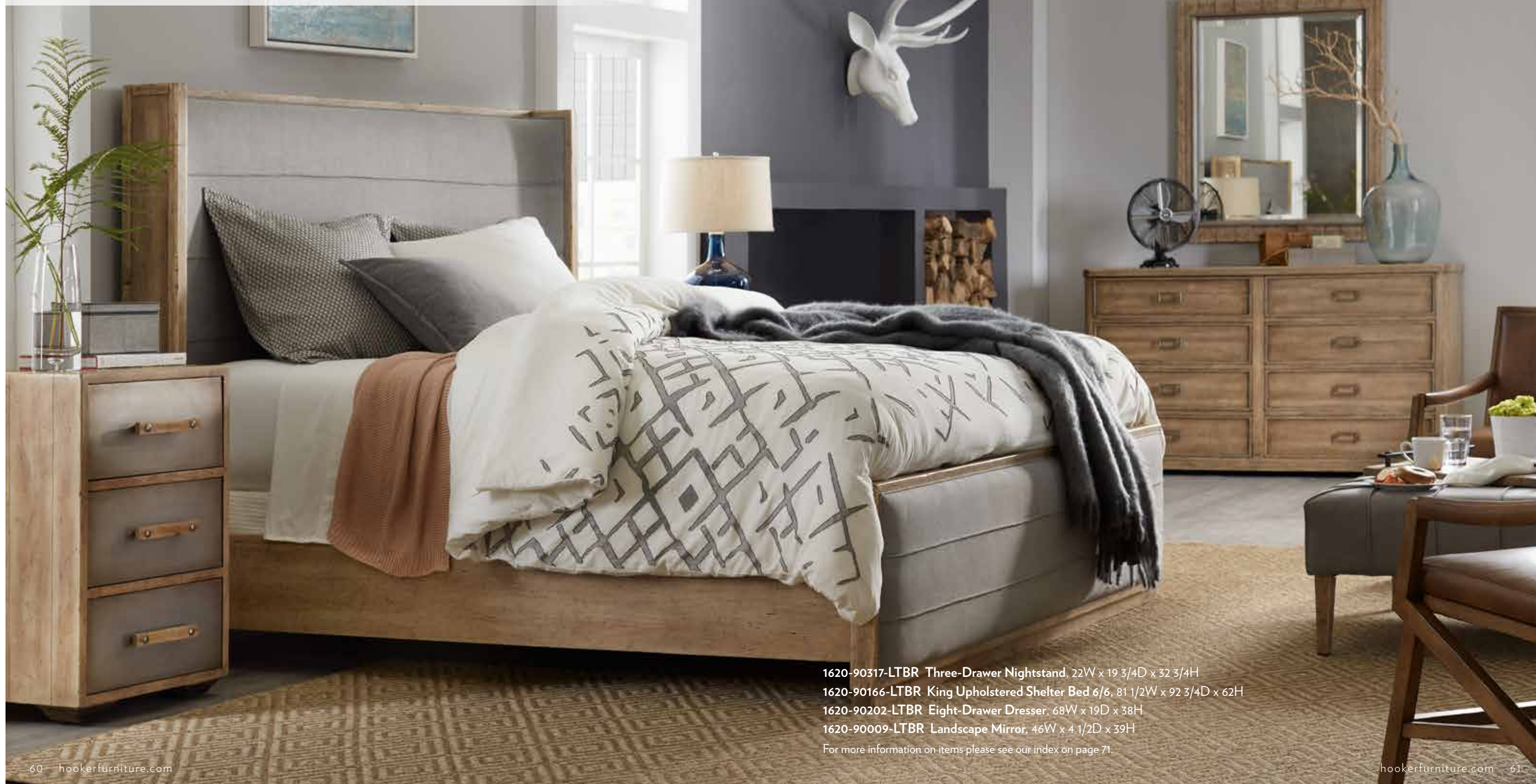
1620-90317-LTBR Three-Drawer Nightstand, 22W x 19 3/4D x 32 3/4H

In a smaller-scale approach, Urban Elevation furniture pieces are crafted of resawn maple, waxed and luxurious to the hand, along with waxed aluminum, small nails and solid maple hardware and exposed bolts. Soft, aluminum-wrapped legs distinguish the dining table, along with metal accents on other pieces.