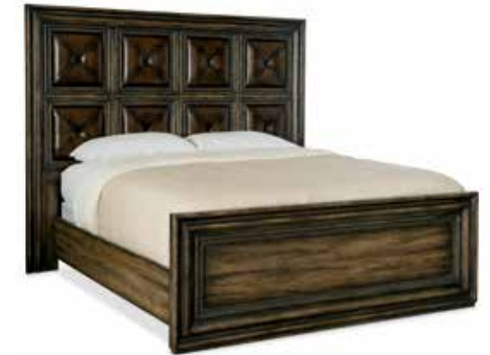
Panel Bed Poplar and Hardwood Solids with Oak Veneer, Resin and Leather: Poetic License