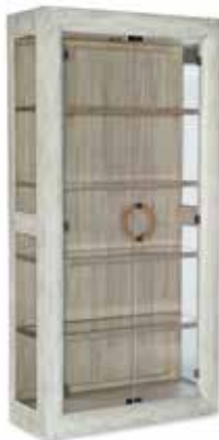
1672-75906-02 Display Cabinet Poplar and Hardwood Solids with Pecan Veneer and Glass; Two glass doors, four adjustable wood framed glass shelves, light with three-intensity touch switch, multiple units can be bunched together 40W x 18D x 86H (102 x 46 x 218 cm) shown on page 3, 4