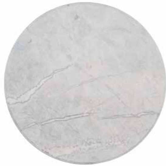
Top View of 1672-75204-00 48-inch Round Pedestal Dining Table