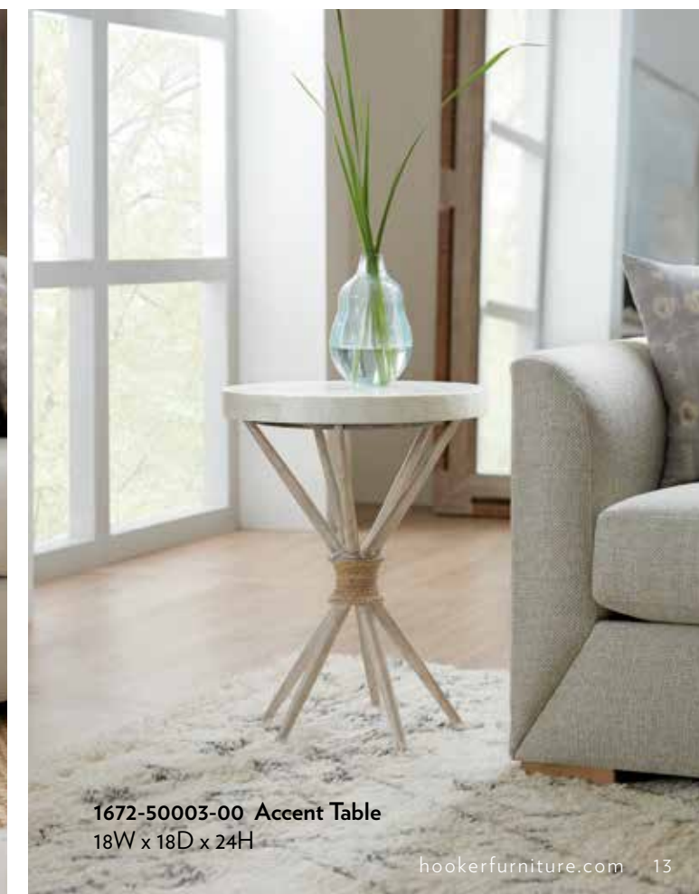
1672-50003-00 Accent Table 18W x 18D x 24H