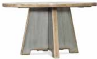
1620-75213-LTBR 54-inch Metal Dining Table Poplar, Maple and Hardwood Solids with Aluminum Sheet. Will seat up to six chairs. 54 Dia. x 30H (137 x 76 cm) shown on page 67