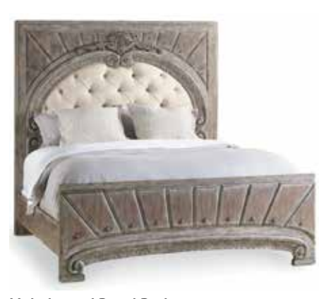
<u>Upholstered Panel Bed</u> Poplar and Hardwood Solids with Pecky

Poplar and Hardwood Solids with Pecky Pecan Veneers Resin and Decorative Nails Fabric: Samantha Cream