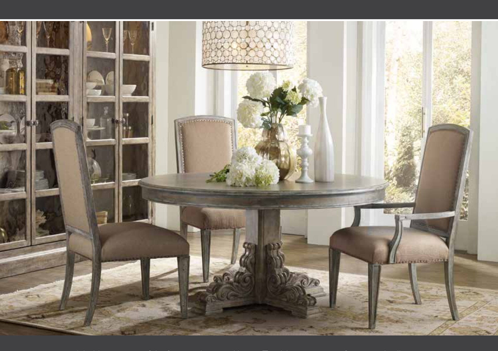
A bold expression of the feminine heart and home, True Vintage is a transformational collection inspired by vintage artifacts, classical motifs and exotic antique doors.