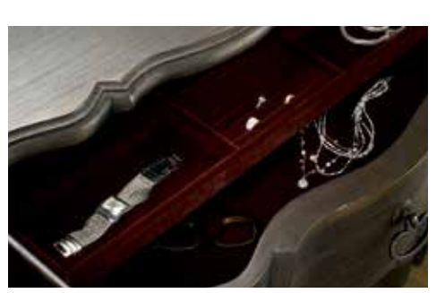
Detail of felt lined drawer