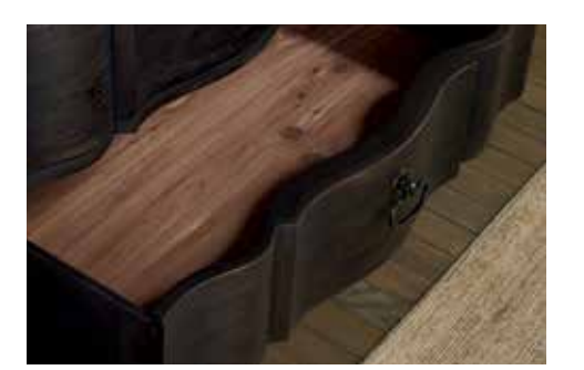
Detail of cedar-lined bottom drawer