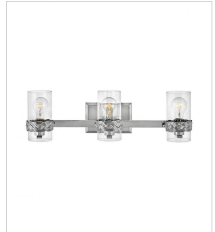
5513PN THREE LIGHT VANITY 24" W, 7" H Socket 3-100w Med.