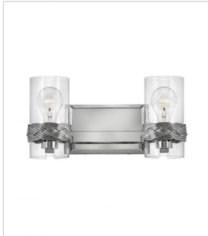
5512PN TWO LIGHT VANITY 14" W, 7" H Socket 2-100w Med.