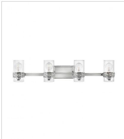
5514PN FOUR LIGHT VANITY 34" W, 7" H Socket 4-100w Med.