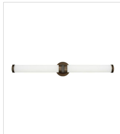
5074CR LARGE LED VANITY 32.8" W, 4.8" H Integrated LED 53w LED *Included