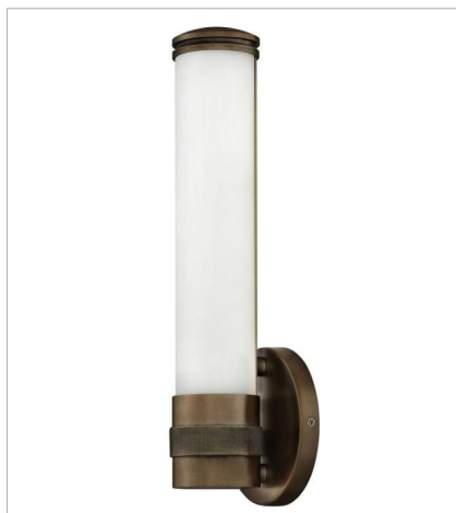
5070CR SMALL LED SCONCE 4.8" W, 14.3" H Integrated LED 17w LED *Included

FINISH: Champagne Bronze GLASS: Etched White