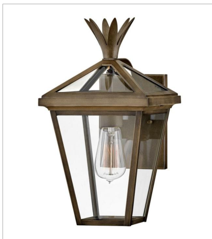
26090BU SMALL WALL MOUNT LANTERN 8" W, 14.5" H Socket 1-100w Med.