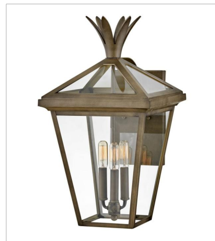
26095BU LARGE WALL MOUNT LANTERN 12" W, 21.5" H Socket 3-60w Cand.