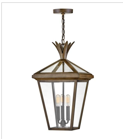
26092BU LARGE HANGING LANTERN 12" W, 21.5" H Socket 3-60w Cand.