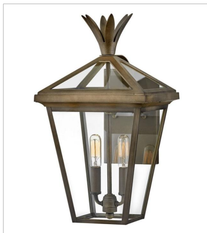
26094BU MEDIUM WALL MOUNT LANTERN 10" W, 18" H Socket 2-60w Cand.