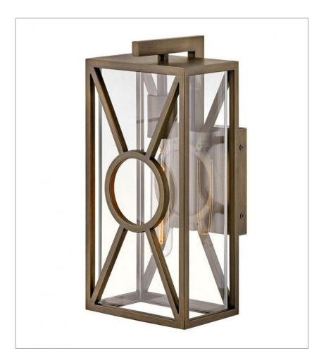
18370BU SMALL WALL MOUNT LANTERN 6.8" W, 14" H Socket 1-100w Med.