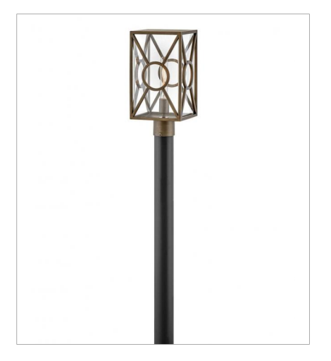
18371BU MEDIUM POST TOP OR PIER MOU... 8" W, 15.5" H Socket 1-100w Med.