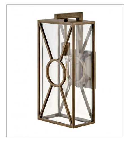
18374BU MEDIUM WALL MOUNT LANTERN 8.8" W, 18.8" H Socket 1-100w Med.