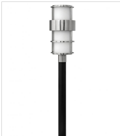
1901SS LARGE POST TOP OR PIER MOUN... 10" W, 21.8" H Socket 1-100w Med.