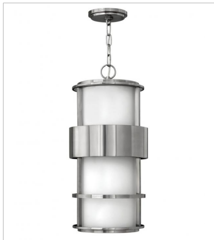
1902SS LARGE HANGING LANTERN 10" W, 21.3" H Socket 1-100w Med.

FINISH: Stainless Steel GLASS: Etched Opal