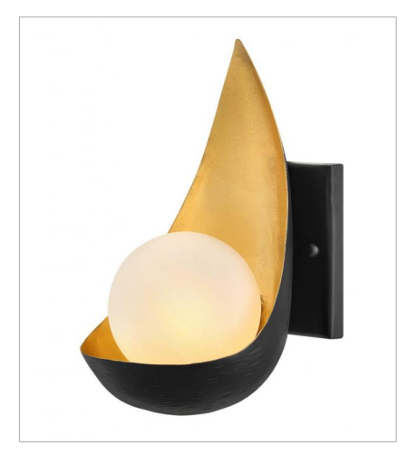
47900BLK SINGLE LIGHT SCONCE 5.5" W, 9.8" H Socket 1-60w G-9