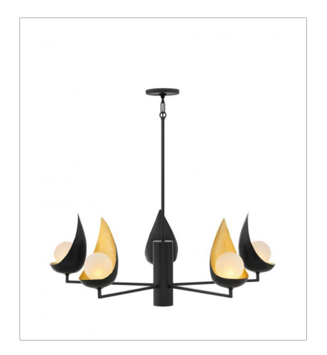
47905BLK MEDIUM SINGLE TIER 36" W, 14" H Socket 1-35w GU10 & 1-35w GU10