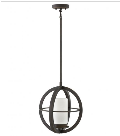
1012OZ LARGE HANGING LANTERN 14" W, 14.8" H Socket 1-100w Med.