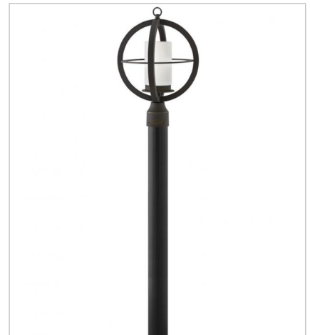
1011OZ MEDIUM POST OR PIER MOUNT L... 12" W, 17" H Socket 1-100w Med.