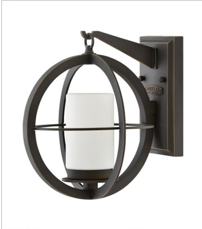
1010OZ SMALL WALL MOUNT LANTERN 10" W, 11.8" H Socket 1-60w Cand.

FINISH: Oil Rubbed Bronze GLASS: Etched Opal