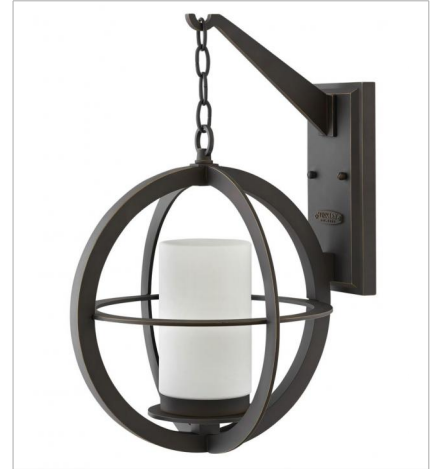
1015OZ LARGE WALL MOUNT LANTERN 13.8" W, 21" H Socket 1-100w Med.