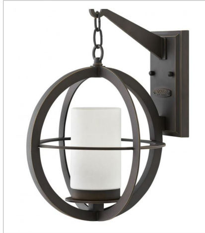
1014OZ MEDIUM WALL MOUNT LANTERN 12" W, 16.3" H Socket 1-100w Med.