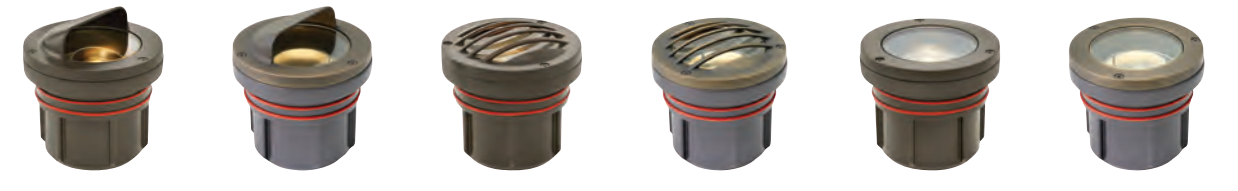
15708 BZ SHIELDED WELL LIGHT