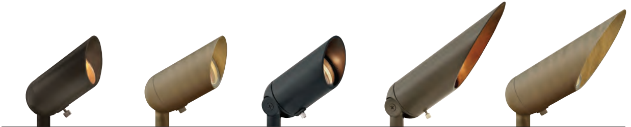
1536 BZ SPOT LIGHT