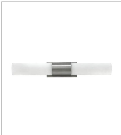
52112BN SMALL LED VANITY 19" W, 3" H Integrated LED

FINISH: Brushed Nickel GLASS: Etched Opal