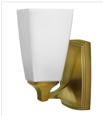
53010BC SINGLE LIGHT VANITY 5.8" W, 8.3" H LED Lamp, Socket

FINISH: Brushed Caramel GLASS: Etched Opal