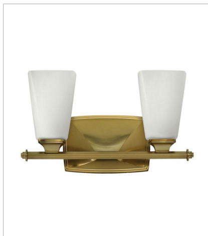
53012BC TWO LIGHT VANITY 14" W, 8" H LED Lamp, Socket