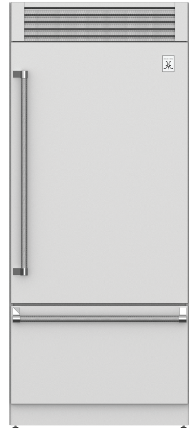
Model as shown KRPR36