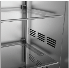
Adjustable Shelf System