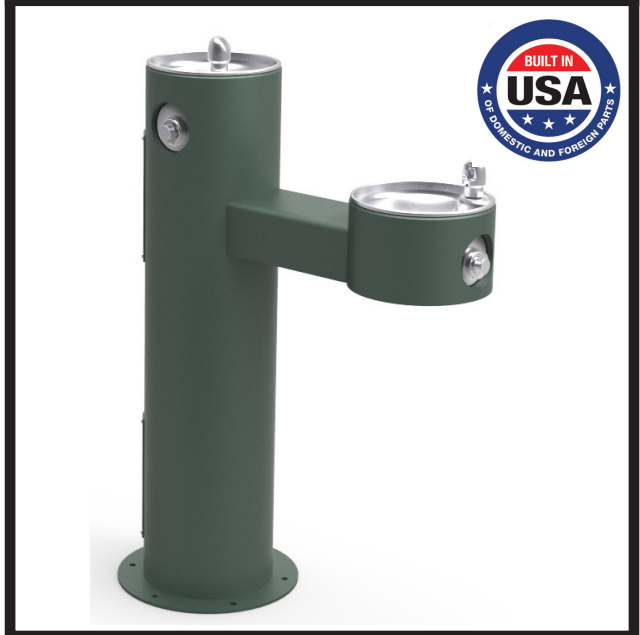
Model 4420SFRK is shown.

Note: Continued product improvement makes specifications subject to change without notice. See Halsey Taylor website for most current spec sheet.