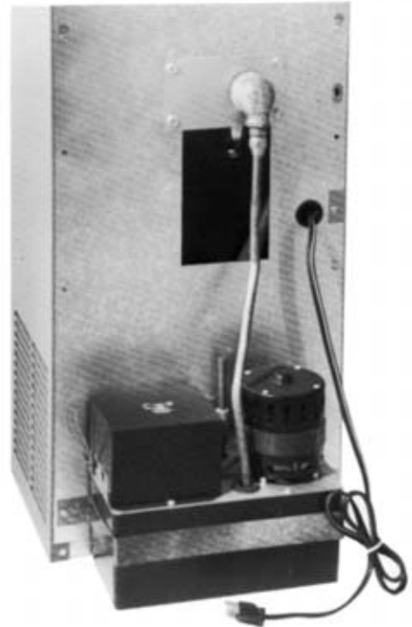
View of installed Sump Pump Kit