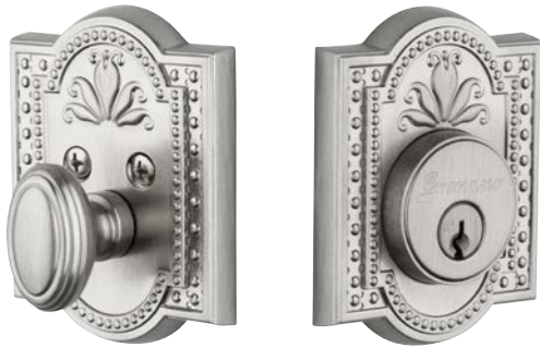
Parthenon Deadbolts shown in Satin Nickel

> Functions: Single Cylinder, Double Cylinder