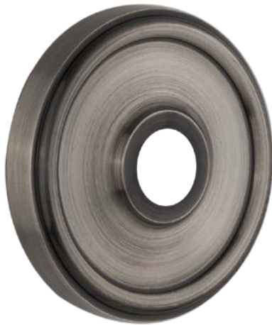
Georgetown Rosette shown in Antique Pewter