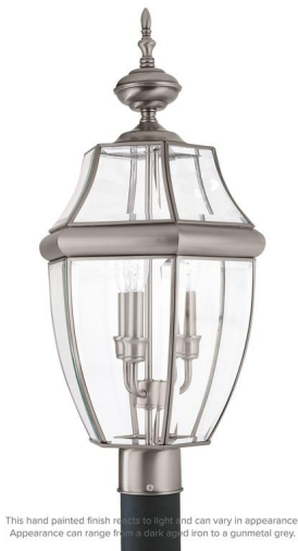
This hand painted finish reacts to light and can vary in appearance. Appearance can range from a dark solid iron to a gunmetal grey.