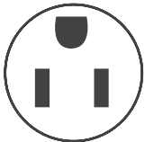
Plug Type (NEMA) 5-15P

1 Warranty 5 year sealed system/1 year full parts and labor.