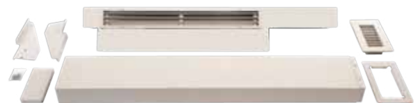
PDXDAA and PDXDEA ship together