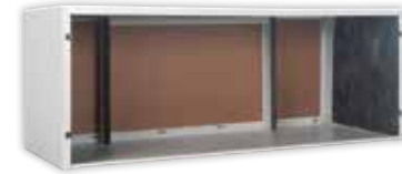
Deep wall sleeve extension PDXWSEXT18 shown with weather panel in place

One-piece, extended wall sleeve with built-in baffle for walls from 13 1/4" to 25 1/2" deep are available by special order.