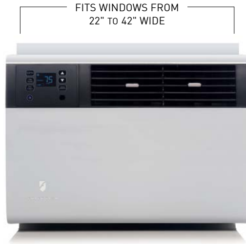
Kühl SQ/EQ Models