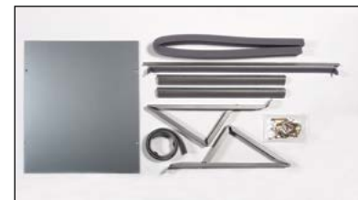
KWIKSB, KWIKMB, KWIKLB