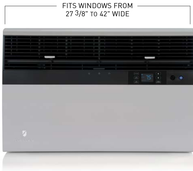
Kühl SS, SM and SL Models Kühl+ ES, YS, EM, YM, EL and YL Models

Full LCD display shows MODE, FAN SPEED, SET TEMPERATURE and SCHEDULE. Adjust TEMPERATURE and FAN SPEEDS, set AUTO MODE and turn the SCHEDULE ON/OFF.