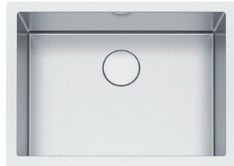
PS2X110-24-12 Interior Dimensions: 24" x 17" x 12" Minimum Cabinet Size: 30"