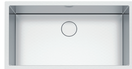
PS2X110-33 Interior Dimensions: 33" x 17" x 10" Minimum Cabinet Size: 39"