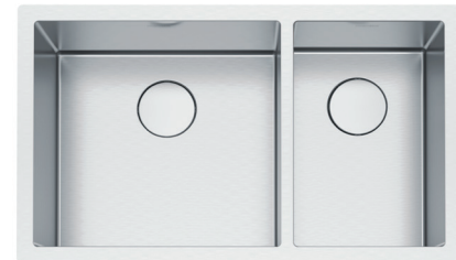
PS2X160-18-11 Right Bowl Dimension: 18" x 17" x 10" Left Bowl Dimension: 11" x 17" x 9" Minimum Cabinet Size: 36"