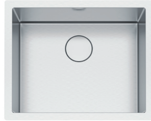
PS2X110-21 Interior Dimensions: 21" x 17" x 10" Minimum Cabinet Size: 27"