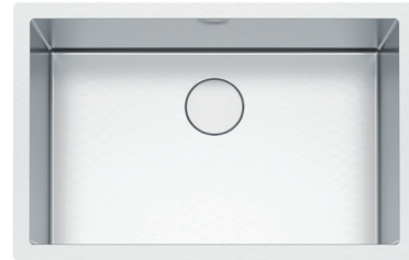
PS2X110-27 Interior Dimensions: 27" x 17" x 10" Minimum Cabinet Size: 33"