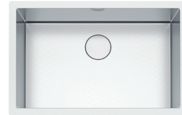
PS2X110-30-12 Interior Dimensions: 30" x 17" x 12" Minimum Cabinet Size: 36"