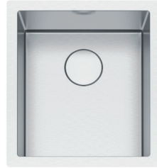
PS2X110-15 Interior Dimensions: 15" x 17" x 8" Minimum Cabinet Size: 21"