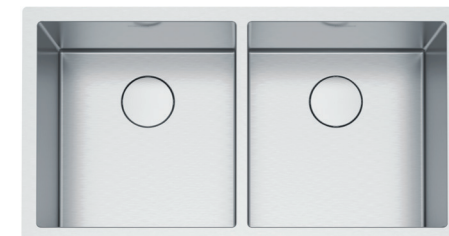
PS2X120-16-16 Right Bowl Dimension: 16" x 17" x 10" Left Bowl Dimension: 16" x 17" x 9" Minimum Cabinet Size: 39"