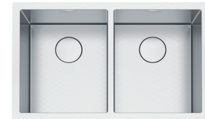
PS2X120-14-14 Right Bowl Dimension: 14" x 17" x 10" Left Bowl Dimension: 14" x 17" x 9" Minimum Cabinet Size: 36"