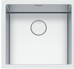
PS2X110-18 Interior Dimensions: 18" x 17" x 10" Minimum Cabinet Size: 21"