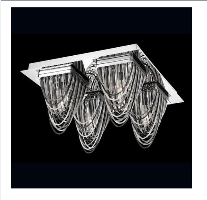
3 tone draped metal chains with chrome accent