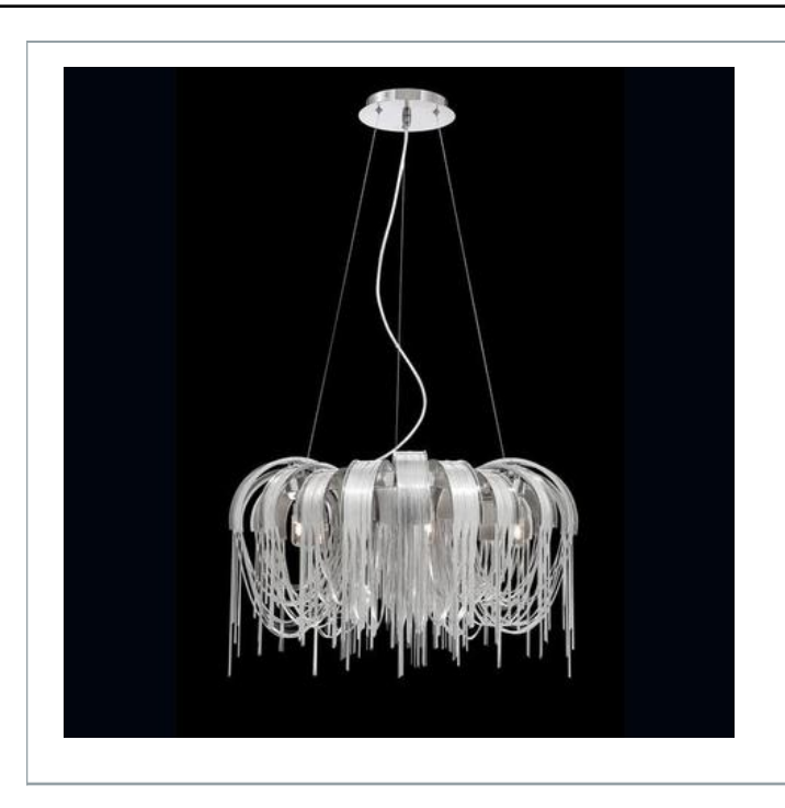
Draped nickel chain wrapped around curved nickel strips