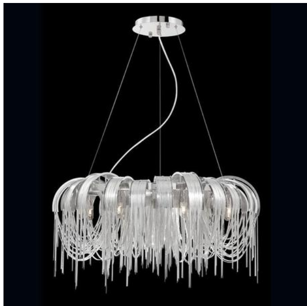
Draped nickel chain wrapped around curved nickel strips