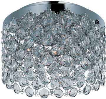
E21150-20PC Dazzle 4-Light Flush Mount