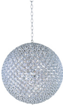
E24018-20PC Brilliant 15-Light Pendant