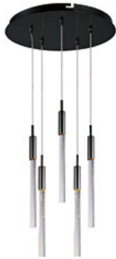
E32775-91BC Scepter 5-Light Pendant