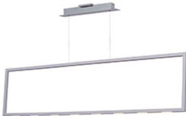
E22866-MW Rhombus LED Pendant