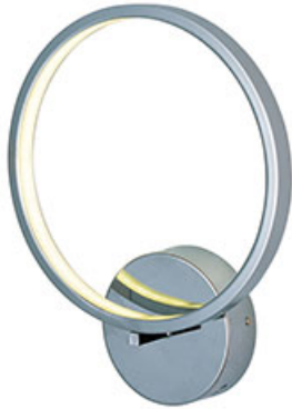
E22710-PC Hoops LED Wall Sconce