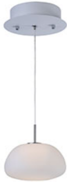
E21122-11WT Puffs 1-Light Pendant